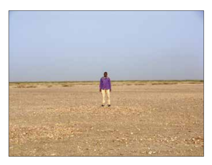
Plate 1. General view of Goaiz es-Shor site.

Located some distance to the north east of Gwada village, and to the south east of the Sheikh Kamal ed-Din village, in the plain. Herbs and spiny shrubs abound on the surface of the site. The main feature is the qubba of Sheikh Mohammed As-Selaihabi, who passed away in 1275 AH. He was a disciple of Sheikh Ahmed et-Tayib, son of el-Bashir the first sheikh