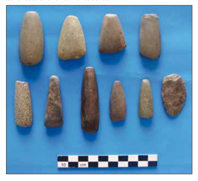
Plate 4. Axes and adzes – Goz Habbabna.

Located to the east of the village of el-Mahraiba Bilal, to the west of the village of Wad Eghaibish, it extends over a large area of up to 5km², in an area of goz. This region does not fall within the Gezira Agricultural Scheme lands. Large quantities of archaeological remains dating to the Neolithic are visible on the surface, especially many different sized axes and adzes (Plate 4), grinders and pottery. A wide range of stone types were used to make the axes including flint, basalt and granite. Also on the surface were many types of ivory lip-plugs (Plate 5) and a few beads. This site is the largest of those studied during this season. It is closely similar to the sites along the Nile, especially those in the Khartoum district (Caneva 1988; Choldnicki et al. 2011). It is suffering from destruction in some parts due to indiscriminate digging, but other sections remain untouched.