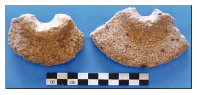
Plate 6. Maceheads from the surface of Goz Abu Gunbak 2.

Located immediately west of the village of Abu Gunbak, and on the western border of the Gezira Agricultural Scheme. It sits on a few goz, within the flat area. There is an abundance of the archaeological finds on the surface of the Mesolithic and Neolithic, with a variety of types of decoration on the pottery. There is also an abundance of grindstones of various forms and maceheads (Plate 6), and there were some ivory lip-plugs. The human skeletons that appear on the surface are mostly contracted, and similar to those found at many sites in central Sudan, such as Jebel Sabaloka (Suková and Varadzin 2012, 125). However, one of them was lying stretched on its back, aligned north-south. There is widespread grazing over the site, which is threatening to cause damage to archaeological material.