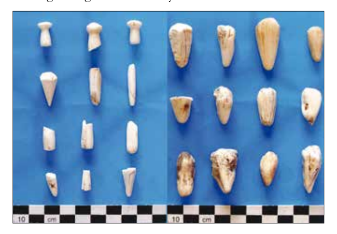
Plate 5. Types of ivory lip, nose and ear-plugs – Goz Habbabna.

Located on the south-eastern side of the village of Goz Abu Gunbak, surrounded by agricultural land, in a flat area interspersed with many Acacia nilotica (Sunt) and Balanites aegyptica (Heglig). There were a few artefacts dating to the Mesolithic: Wavy Line and Dotted Wavy Line pottery and fragments of grinding tools along with an occasional microlith. The site is being damaged due to heavy traffic movement around it.