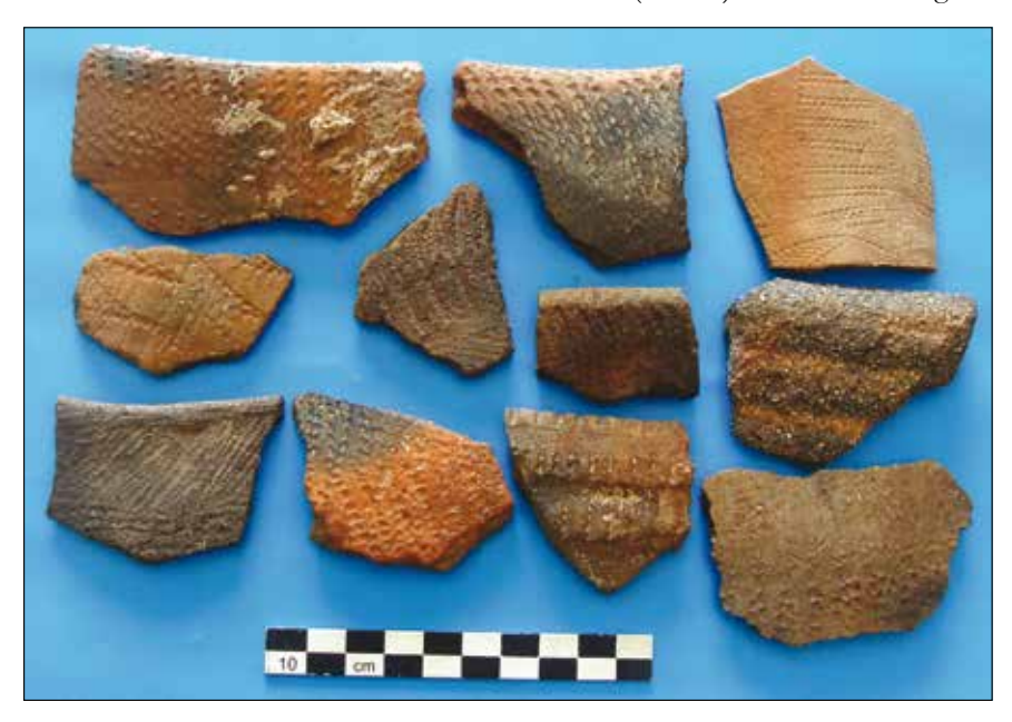
Plate 7. Pottery with Dotted Zigzag motifs – Goz Sheikh Modawwi 1.

in a goz area stretching for up to about 2km. Trees and grass cover large parts of it, as it descends toward the south and east. This site contains many forms of grindstones, as well as Mesolithic and Neolithic pottery. The presence of Dotted Zigzag pottery suggests that the occupation here represents a transition between the Mesolithic and Neolithic (Plate 7).