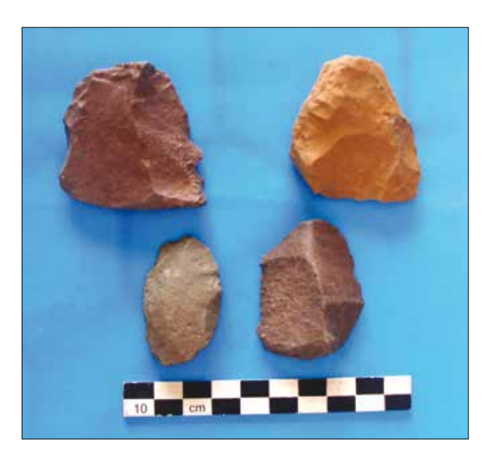
Plate 2. Stone tools from the surface of Goz er-Rehaid 2.

by the expansion of housing. The largest threat comes from heavy machinery digging and moving earth.