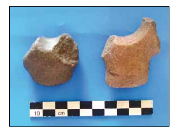
Plate 3. Axes with a hole for insertion of a handle – El-Uqda.

on the surface. The presence of the modern cemetery has protected the site from encroachment and digging, but it has to be studied as the modern cemetery is expanding and encroaching on the site. The site can be compared with Early Khartoum in terms of Wavy Line pottery (Arkell 1949, pl. 61).