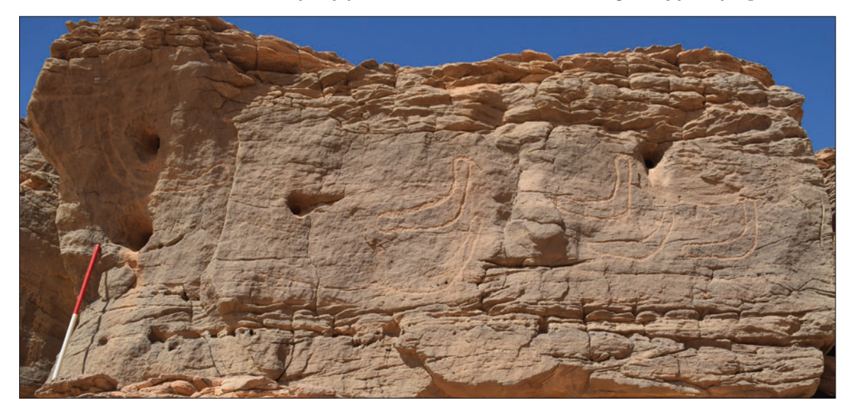
Plate 4. The central wall depicting 'angular' boats (nos 5-10).