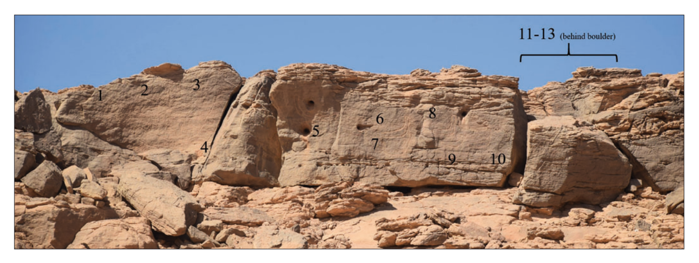
Plate 3. The boat tableau on the east face of Jebel Maraekib. Each boat is numbered sequentially from left-right.