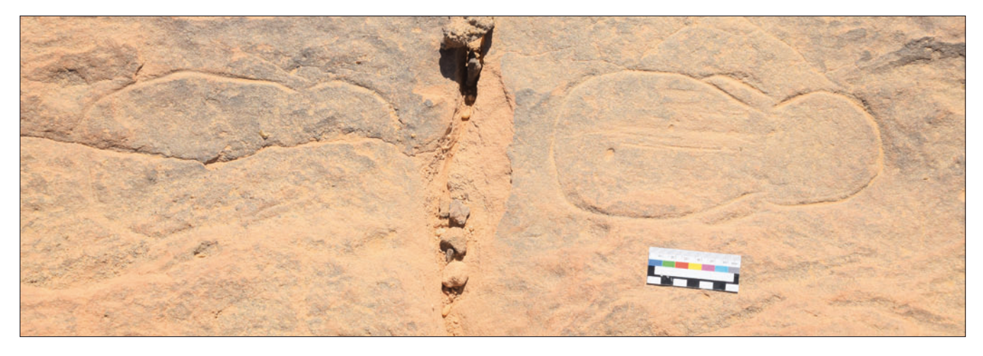
Plate 10. Footprints on the plateau above the boat-scene.

<sup>8</sup> Two good parallels have been observed at Khor es-Salaam (Červiček 1974, 28, fig. 84) in the Egyptian Nile Valley. Another one is situated along the road between Qena and Quseir (Červiček 1986, 7, fig. 33). An engraving from the Wadi Hammamat shows some similarities (Rohl 2000, 129, fig. 6). Vulture Rock, in Elkab, also bears one very similar angular boat (Huyge 1995, 122, pl. 64 A-B). In Lower Nubia, such boats have been documented at Khor Takar II (Engelmayer 1965, 24, pl. XII, fig. 4), Umm Galan Bahari (Engelmayer 1965, 58, pl. XLIII, fig. 1), between Khor Abu Bakr and a Coptic installation (Engelmayer 1965, 53, pl. XXXVIII, fig. 6b), and at Nag Kolorodna (Basch and Gorbéa 1968, 35-36, 109, fig. 3a-b, 83). It is interesting to note that the example from Khor Takar II has a helmsman and a rope fixed at the top of the prow. The boat engraved between Qena and Quseir also has a rope attached to its prow.