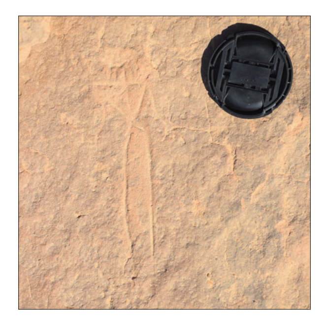
Plate 9. Figural representation in the rock art.

are rare but not unique.<sup>8</sup> At close distance to the left of the main group, a similar boat (no. 5) is engraved though more elongated. Its high prow and the short protruding rope leaves no doubt as to its orientation to the left, so in the opposite direction than the adjacent fleet.