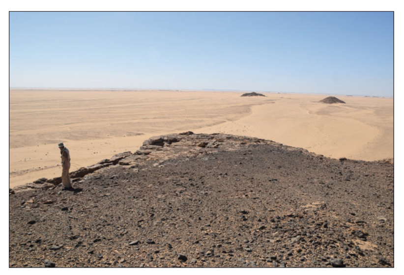
Plate 11. View from the plateau above the boat scene, Pierre Meyrat pictured.

on the small plateau directly above the main wall. Several artificial features sometimes known as 'scoops', 'cups', or 'cupules' were found, as were a series of linear strokes (Plate 8).9 These kinds of notches, interpreted by some scholars as counting or tally marks, are well-known from other desert sites such as those on the Abu Ballas trail and hilltop sites around Dakhleh oasis (Förster 2015, 267-271 and Kaper 2009, 171. The site recorded by Liverani near Jebel Barkal also contains both notches and cups, see Liverani 1997, 176). Additionally, a standing anthropomorphic figure was also identified (Plate 9). This figure is somewhat unique, with no certain or exact parallels, but close examples with 'triangular' torsos are known from other rock art sites (Dunbar 1941, pl. XXIII.133; Hellström and Langballe 1970 (volume 1:2), corpus A99 and/or 303; Kaper and Willems 2002, 85, fig. 4). Elsewhere on the summit there was a depiction of feet or footprints with apparent sandal straps (Plate 10). Footprints or sandal-prints are ubiquitous in the rock art of Egypt and Nubia, but are generally dated to the Old Kingdom and later, although some have entertained prehistoric dates for these images.<sup>10</sup> The contemporaneity of these rock art-features