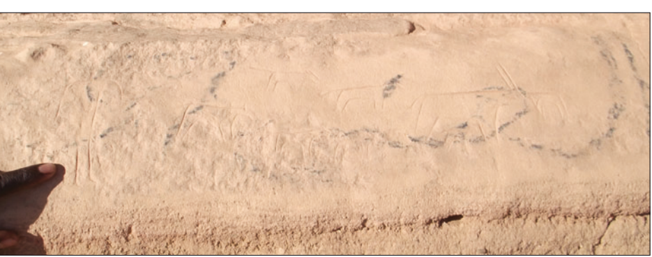
Plate 2. An enigmatic depiction at Jebel al-Sayd', possibly depicting boats (?) or a bird (?) (below) and a scene of a hunting, depicting dogs chasing quadrupeds (above).

Hieroglyphic and hieratic inscriptions are found at Murrat and on the west side of Jebel Rafit, where there are also earlier faunal representations, chiefly of cattle (Davies 2014, 31-34). Natural water sources, generally scarce in this part of the Eastern Desert, are found on all sides of Jebel Rafit, including Murrat (A good account of the water sources and vegetation around Rafit in the 19<sup>th</sup> century is in Mitford 1937, 77-78. See also Gleichen 1905a, 87-88; Gleichen, 1905b, 2-3).