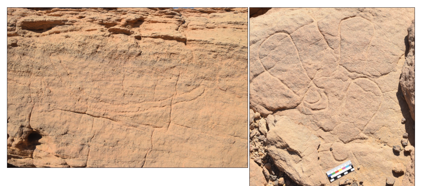
Plate 1. Site AI, a single boat petroglyph and a depiction of three feet with sandal-straps on the rock-shelf above.

One of the logical destinations of these routes leading east of Lower Nubia would have been the well of Bir Murrat, a favourite stopping point of camel caravans well into the 19<sup>th</sup> century and the location of a British fort during the Mahdiyya. Judging from the ubiquitous prehistoric faunal representations and easy access to water, the Murrat area and the massif of Jebel Rafit was probably a major node in the Eastern Desert for both foreigners and indigenes. The region was a strategic location in the middle of the Korosko route, and possessed some pasturing opportunities and gold mines.