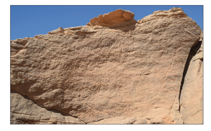
Plate 5. Southern wall with four boats (nos 1-4) including the 'official' boat. Note that much of the right part of the hull of the official ship follows a natural crack in the rock surface.