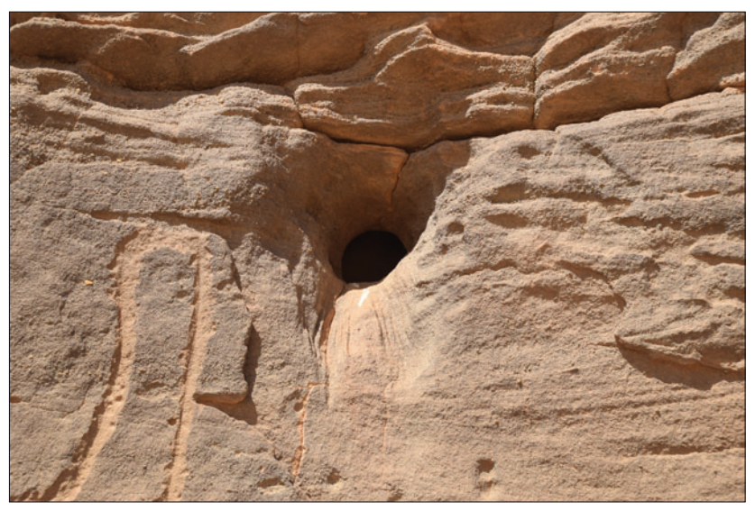
Plate 7. A natural hole with artificial marks on the main wall, next to boat no. 8.

case further south in the Eastern Desert, and while there has been little paleoclimatic research in this specific region, studies at near comparable latitudes in the Western Desert (Laqiya, Wadi Shaw) would indicate a climate much more conducive to desert travel than the present day with much more advantageous seasonal water sources and vegetation (Riemer, Lange and Kindermann 2013, 177ff). From the indigenous perspective, such conditions would have made herding and migratory nomadism much easier along these routes in the prehistoric than ensuing periods.