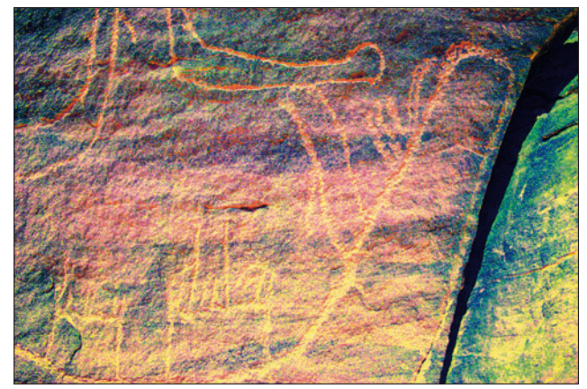
Plate 6. False colour image of the 'official' boat from Dstretch revealing features in greater detail.