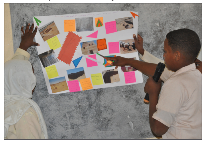
Plate 5. Each group completed a unique poster and presented them to the guest audience and their schoolmates.

According to the workshop evaluation, all of the participants including the teachers enjoyed the activity, while 10 out of 23 answered that they did not expect it to be as it was. Perhaps because education in Sudan is largely a one-way teaching approach based on textbooks and with no art class, this type of interactive and creative method of learning and working with their hands may have been a new experience. Overall,