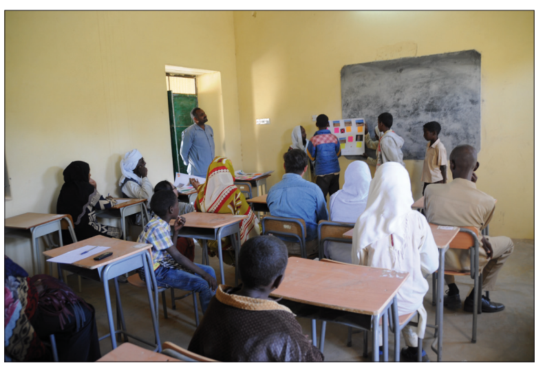
Plate 6. The students presentations spoke of the characters and importance of the site and the invitation to visit the site.

it highlighted that the workshop raised awareness about the importance of preserving the site and stimulated the curiosity of the students towards the site and archaeology. The exposure to archaeology and excavation was an important aspect, and was a surprise for the students during the workshop, as reported by the participants: 'archaeologists work hard, their work is very hard' and 'modern tools can be used in digging excavations'. Although the excavation workers are from the community and it could be presumed that their experiences might be shared with their family and neighbours, how archaeologists work and excavate structures and objects are not familiar topics for local students. It also suggested that the site is seen as 'local heritage', which is reflected in some of their comments about site protection such as 'archaeological remains are our history and we should protect and know more details about them'; '(message) for archaeologists, please protect this heritage'. What we learned in this workshop is that it would be important to consider a storyline that includes Old Dongola as local heritage and to