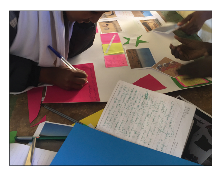
Plate 4. A student made extensive notes in her notebook to remember what she learned from the site visit and copied them onto the poster.

different information and messages for promotion of the site on their colourfully decorated posters. They also took many photographs of the landscape, monuments, and details of remains that they used effectively in their posters. Monumental and familiar household features, such as the granite columns of the church, and a doorway and fireplace drew most of their attentions. The tour included an excavation experience to uncover walls of the 17<sup>th</sup> century remains by brushing, which was unexpectedly hard work for them.