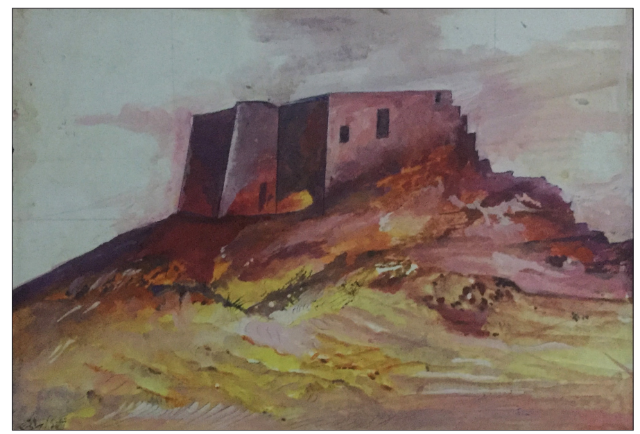
Plate 1. The mosque at Old Dongola, painted by a local artist and retired teacher for the project logo design.

the local understanding of the landscape. Some of the Ghaddar residents once lived in the southern part of the archaeological site at a so-called 'Abandoned village'. Families of the former residents return to the village during the celebrations of Eids and the Mawlid al Nabi . During these festivities, Ghaddar residents also visit ancestral graves and qubbas in the Muslim cemetery. The first prayer of the Eids is still held near the mosque at the Old Dongola site, which was converted from the royal throne hall in AD 1317. The mosque is the oldest surviving mosque in Sudan and was the only building in use until its closure in 1969, with some interruptions, from the mid-9<sup>th</sup> century (Żurawski 2001). The importance of the building for the community is evident from a painting presented by a retired teacher for the creation of the engagement project logo (Plate 1).