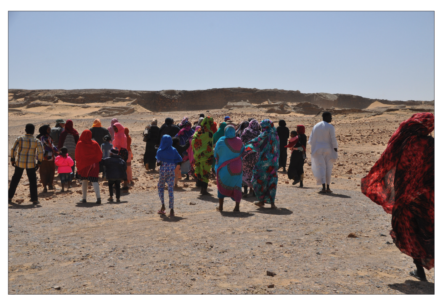
Plate 7. Many women and children participated in the guided tour during the Site Open Day.

interviews and through the tourism office. A welcome message at the information centre and brief interpretations were posted at the entrance of the Royal Church and Mosque. Fifty-two (28 women; 21 children; 3 men) people from Ghaddar, including five participants from the Poster Workshop, showed up and joined a tour. The participants traversed the site by foot or vehicles. Most people arrived after breakfast time (around 10-11am), between 12 and 1pm, though the first arrival was at 10am. Some women who joined the tour returned to the on-site information space where the tour started, and a seating area was created. The tour involved too much walking up the hills on sand for some women, while the other women waited at the information space until the tour reached the mosque. This is because the mosque is usually closed to local residents and visitors, so some of them had never seen the interior. The number of women who participated far exceeded the men, partly because there was a rumour among the community that the event was only for women. One man later remarked that he would have liked to join. Our inspector also pointed out that many men went to the song, as it was the Ghaddar song day (Saturday). He suggested making an announcement next time at mosques, nadis and souq to invite more men.