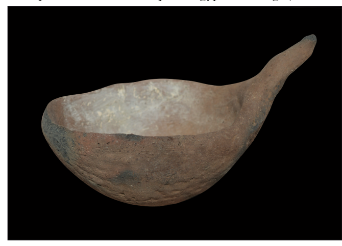
Plate 5. Vessel 7521x, a ladle with faint matt impressions on the base.

High concentrations of indigenous material suggest that this site remained outside of Egyptian control and retained local practices, but the frequent Egyptian storage jars and,