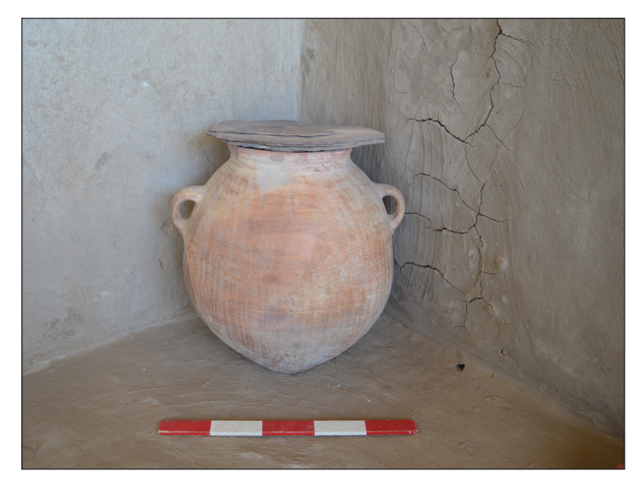
Plate 1. Vessel 7520x from Building 4, a large storage jar showing vertical burnishing with a stone lid.

Two pits in square G10 contained a mixed-date deposit, with many joining sherds dateable to the later New Kingdom, including straight-rimmed, funnel-necked jars (e.g. Aston 1998, 195, pl. 29 nos 243–244; 210, pl. 44 no. 378; 190 pl. 24 no. 222; Thomas 2014, 66), simple and deep wheelmade bowls, and domestic cooking bowls. Two bowl fragments (see Plate 2) were decorated with red slip and a white painted rim, with parallels from the Ramesside period (e.g. B. Aston 2011, 209 no. 49; Aston et al. 1998 pl. 15 nos 145, 150). Much