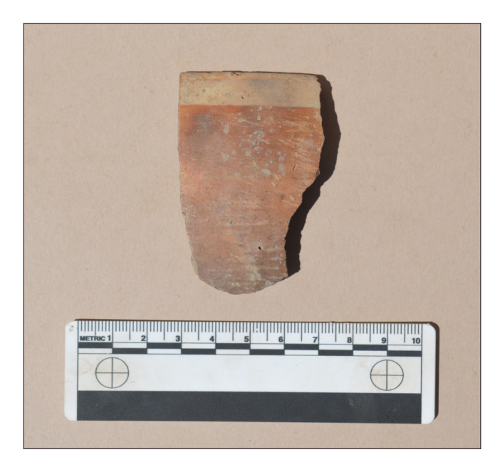
Plate 2. A sherd with a red slip and white painted rim, 7181y.

The discovery of a remarkably well-preserved ladle (Plate 5) in square F6 has some similarities to pinched rim examples found at Aniba in Middle Kingdom/Second Intermediate Period deposits (Steindorff 1935, tafel 95.S36) and in