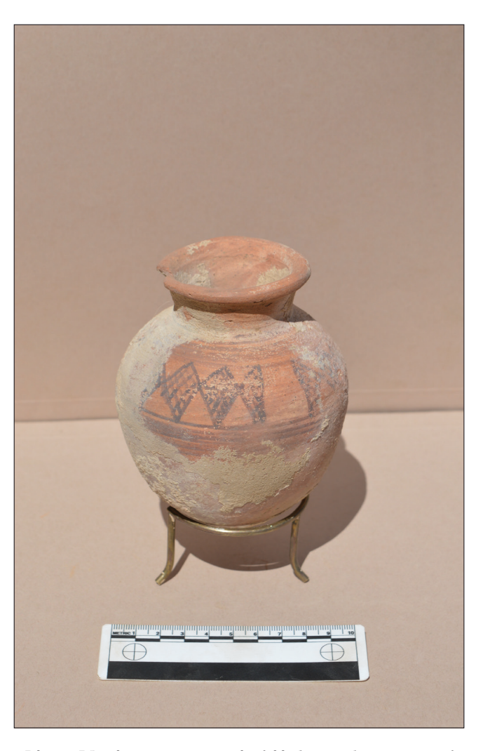
Plate 3. Vessel 7369x, an example of black painted geometric motifs from the 2014 season.