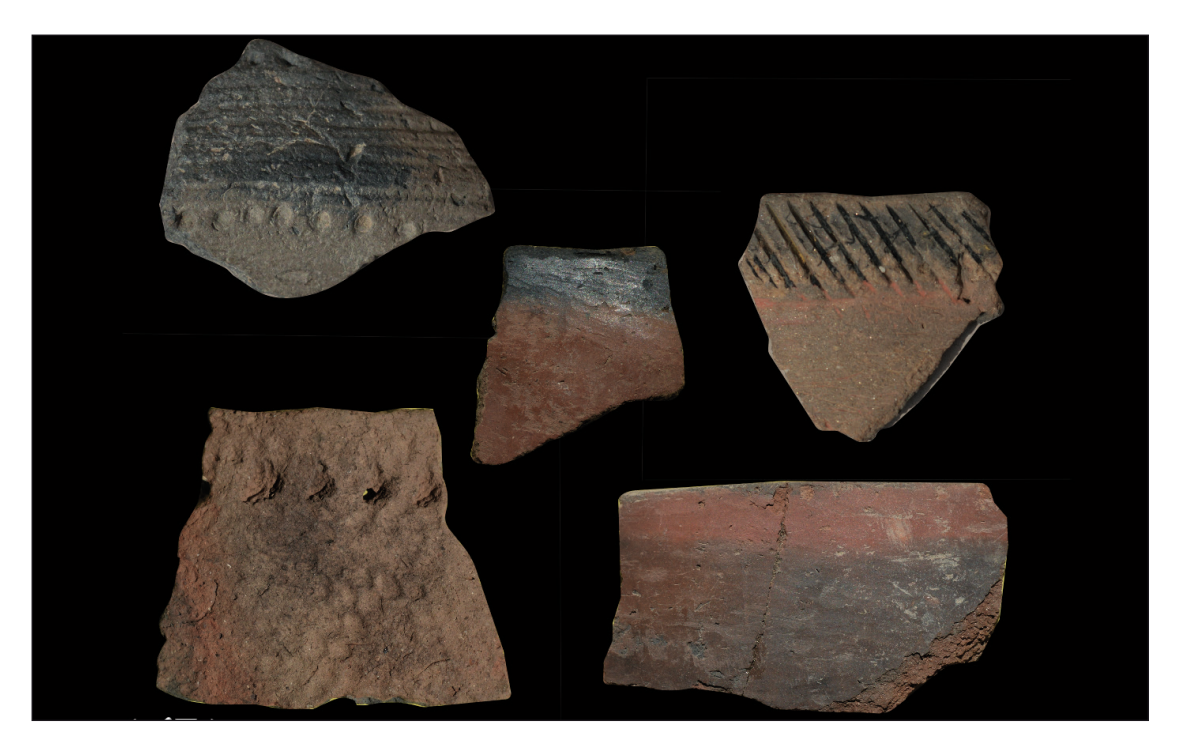
Plate 4. Types of indigenous decoration found in the 2019 season.

Egypt (e.g. Hayes 1953, 247), although this vessel has a true handle. Multiple ladle fragments have been found at the site in previous seasons, all in a coarse Nile silt with traces of burning and matting impressions, and their ubiquity points to a key role in daily activity, likely for drinking water from zir.