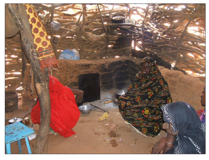
Plate 7. A small wall built to protect the fire from the wind.

of watering their animals in turn. Sheep and goats are watered every four days; thus, they graze in the pastures for a period of two days, and on the third day they return to the well, in order to spend the night not far from it. On the morning of the fourth day they are driven to the well to be watered under the supervision of their owner while their shepherd goes to get his provisions. He may also visit his family to spend the night with them, particularly if he is married. Camels are watered on the fifth day.