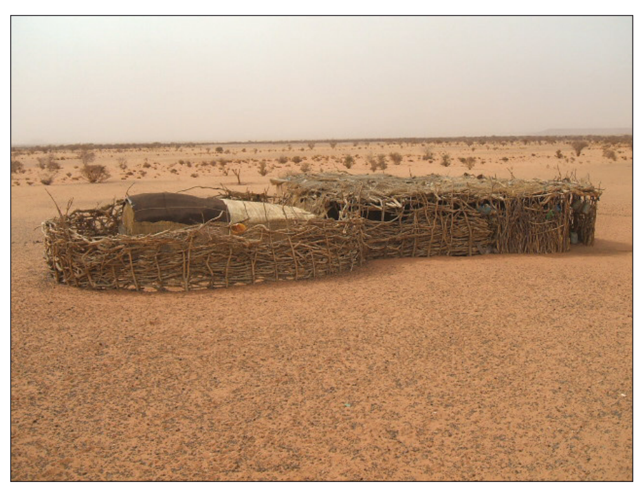
Plate 1. Exterior of a house in the Naga region.

area, which lies at the confluence of the Awateib and Abu Rayhan wadis that surround the archaeological site, is cleaned. The implements used at this stage include the hoe, plough and axe. Oxen were used to pull the plough in the past, but now tractors are used.