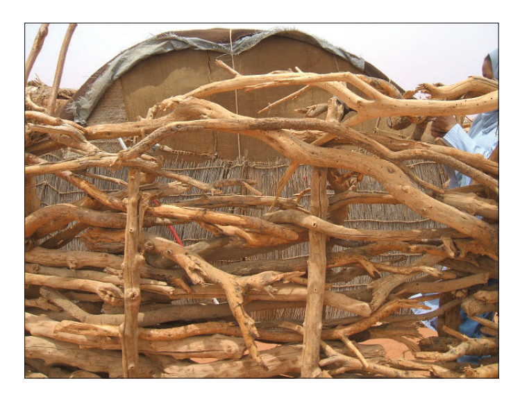
Plate 8. Sareef, a straw fence to keep animals away from a nomad's house.

if the shepherd is a stranger to the area, he will remain close to the animals, carrying his provisions. During the period of grazing, he stays with the animals, sleeping where they sleep and moving with them when awake, carrying his provisions on his donkey. Sheep and goats graze during the night and sleep at midnight - this sleep is known as hajaa', then graze again in the early hours of the morning before sleeping again at midday (al-Hamariya). At this time the shepherd spreads what he carries, whether it is a farwa (prayer rug of sheepskin), sack or blanket and builds a shade to sleep under. Animals sleep again later under the trees, a sleep known as tafle, and at this point the shepherd prepares his food and eats. Sometimes several shepherds gather together; they graze their sheep and help each other if necessary, and keep each other company. In the past shepherds used to carry flutes, but they now carry portable radios.