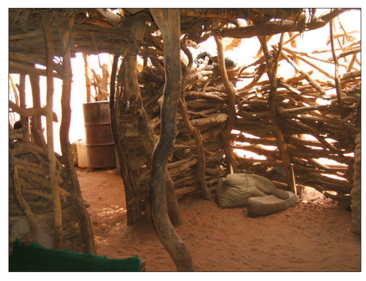
Plate 6. Murhaka and mishan, grindstones and sack of sorghum.