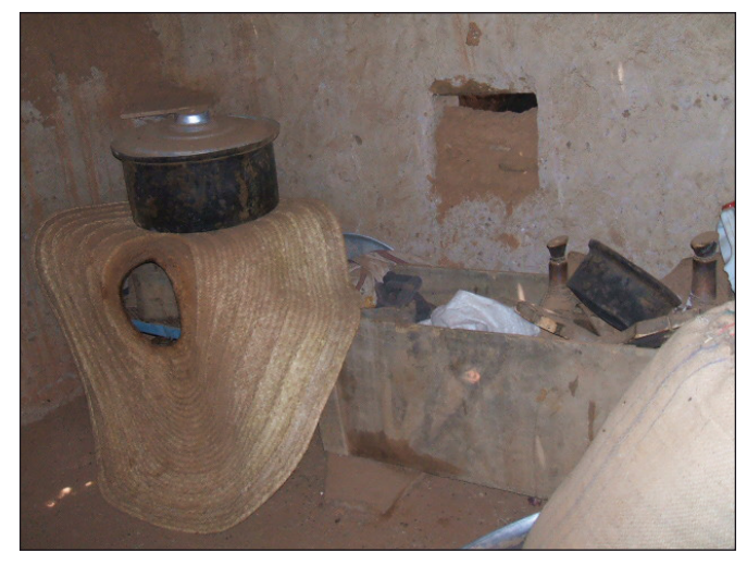
Plate 4. Al-birish, a woven mat usually used by women for dukhaan (a smoke-bath)

The method of watering animals from the wells is as follows: four or five individuals dig a trough for the purpose