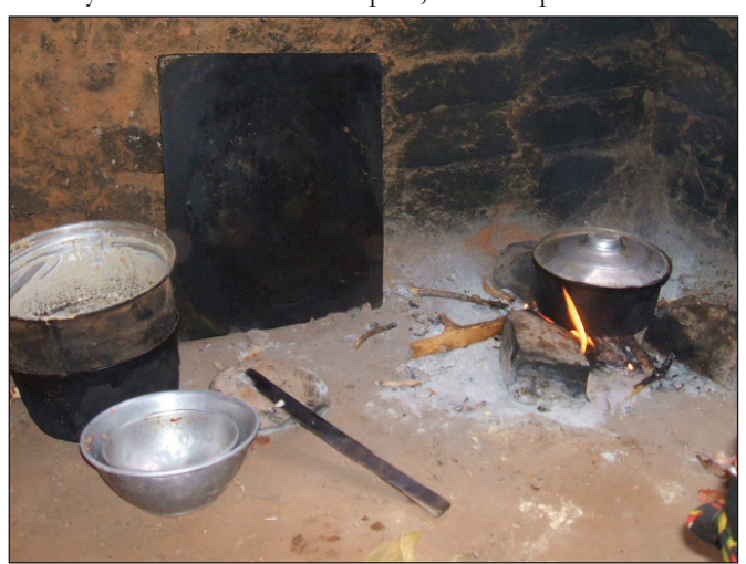
Plate 3. Ladayat and sag-doka, a fire stove and flat griddle.

The population of Naqa rear some cows, but use them for agricultural work only, while sheep, goats and camels are driven to the markets of Khartoum, Wad Hissuna and Shendi to be sold. Pastoralism is considered the main economic activity for accumulation of capital, while crop cultivation is a