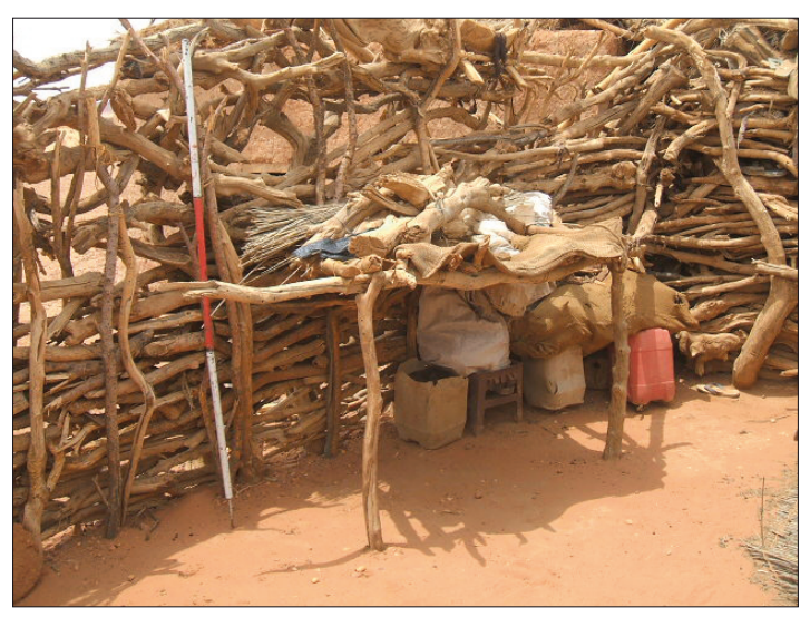
Plate 5. Kut, a rack used for storing water.