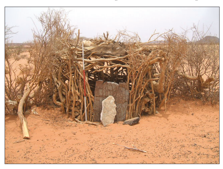
Plate 9. Al-Kud, a pen for kids.

On the murud day (the day of watering the animals), the animals spend the day beside the well or hafir , and no zariba (animal enclosure) is placed or erected for them, and they are left to roam and rest. Watering of the animals is arranged