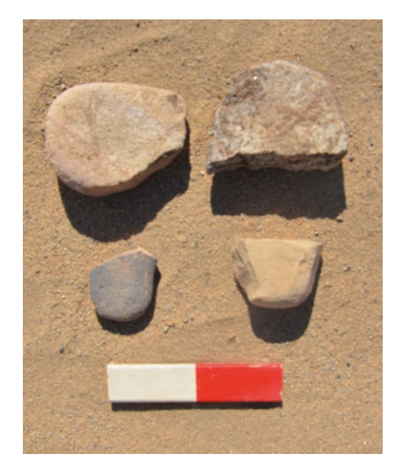
Figure 23. Sandstone grindstones.

to magnetic north. Skeletal remains were found in the chamber (including six skulls). The individuals were dorsally extended, with head to the west. No evidence of coffins or shrouds was found (Figure 24). The second grave was orientated east-west with a sloping shaft c. 2m long, leading to a small chamber at the east end. The chamber entrance had a stone blocking, and the body had been placed within (Figure 25).