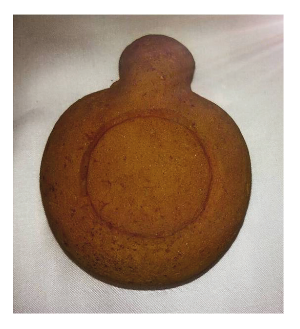
Figure 21. Back of ceramic lamp from B2.