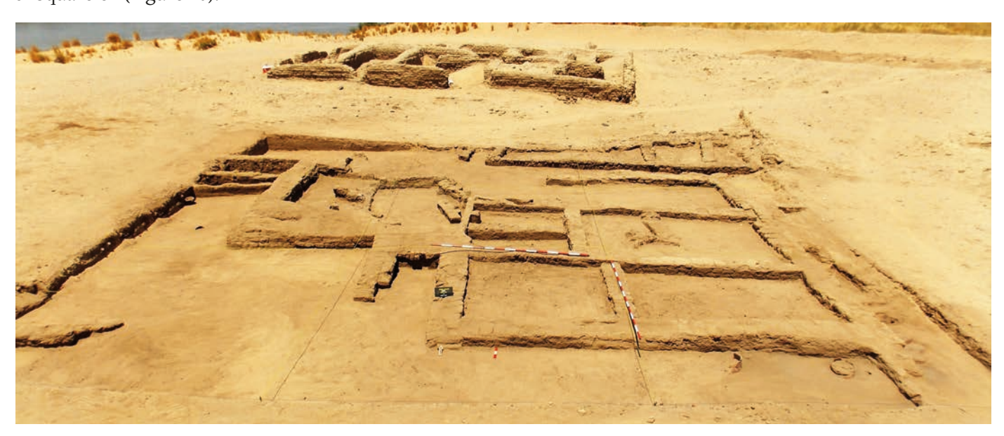
Figure 4. General view of the excavated building.

Another three jars were recovered from the southern end of the same square, set one inside another, and another was found hidden behind a small mud installation (Figure 8). Other large jars were found in the western part of Square B2 where a curved mud brick wall 300mm thick was exposed. Four pots were recovered from beside this wall in B2, and a further two in B1. At the south end of the curved wall in B1, part of a large jar full of charcoal and ash with a diameter of 300mm was found under the wall (Figure 9). A small fine black bowl was also found in the western part of Square C2 (Figure 10).