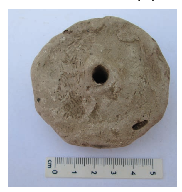
Figure 14. Example of the spindle whorls excavated.