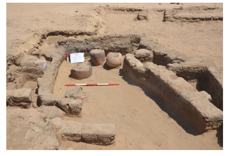
Figure 9. B2, the curved mud brick wall and associated jars.