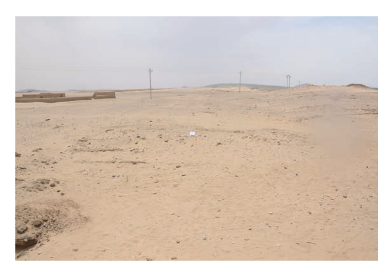
Figure 2. Complex B before excavation.