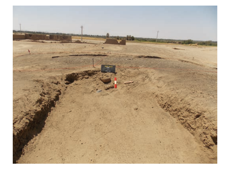
Figure 24. Grave type one.

The excavated area of Complex B forms the greater part of a building, and it seems that it may have been a house. The fill of its rooms largely was