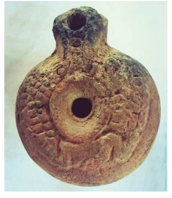
Figure 20. Front of ceramic lamp from B2.