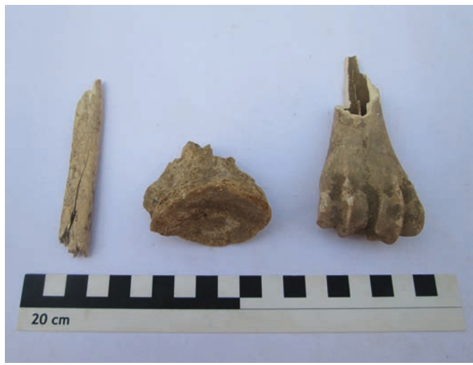
Figure 19. Examples of excavated bone.