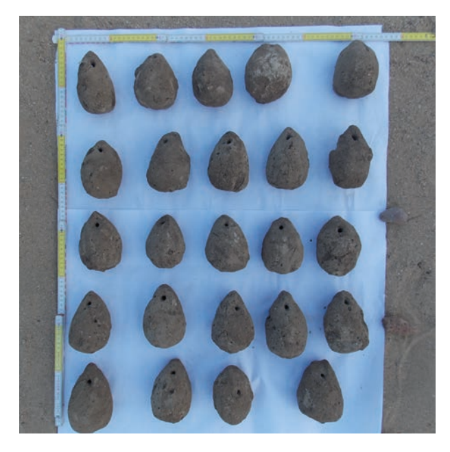
Left: Figure 13. Loom weights from Squares B2 and C2.

Ostrich eggshell was an important raw material used for the production of beads (Näser 2004, 221) and many objects of