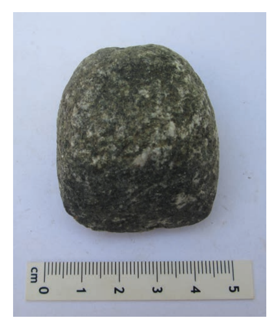
Figure 22. Granite grindstone.