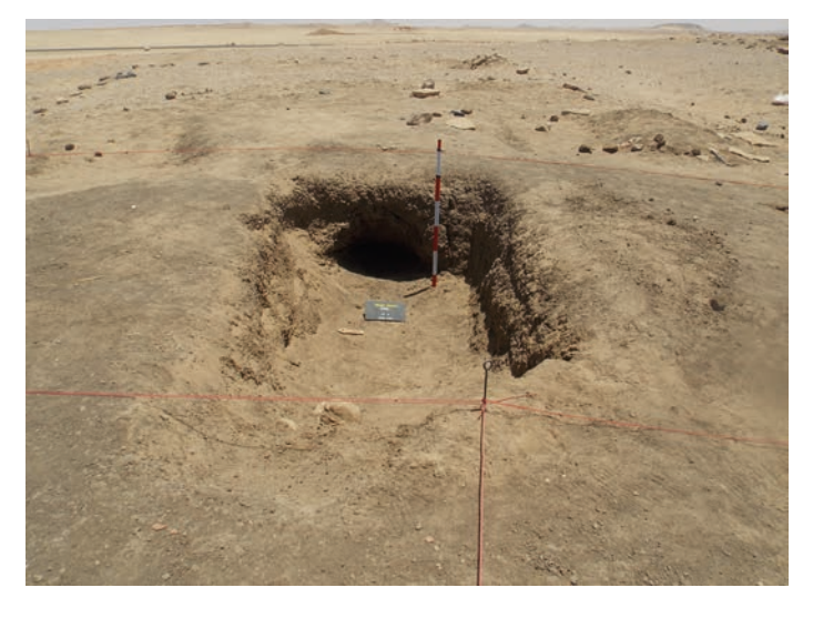
Figures 25. Grave type two.