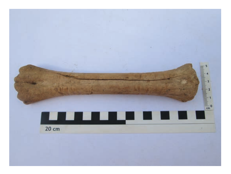
Figure 18. Examples of excavated bone.