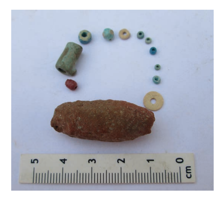
Figure 16. Examples of beads excavated.