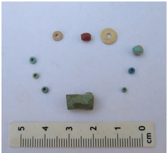
Figure 17. Examples of beads excavated.