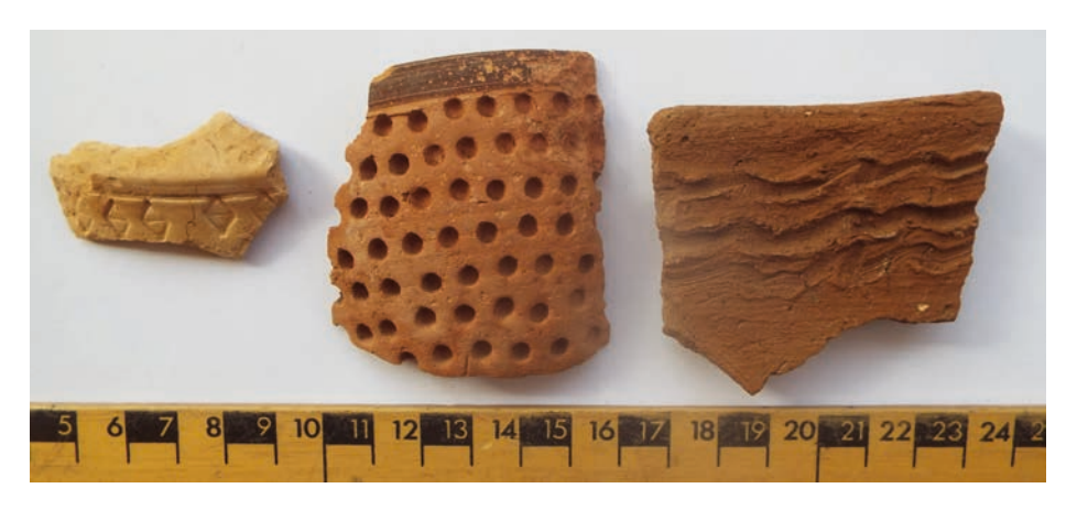
Figure 11. Samples of decorated and painted pottery from the settlement surface.