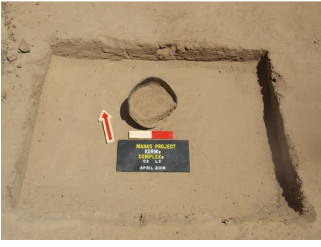
Figure 10. The black bowl found in Square C2.