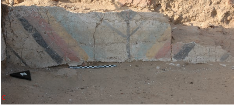
Figure 2. Traces of mortar in situ at the base of the walls of the temple and one of the rooms in the ceremonial palace.