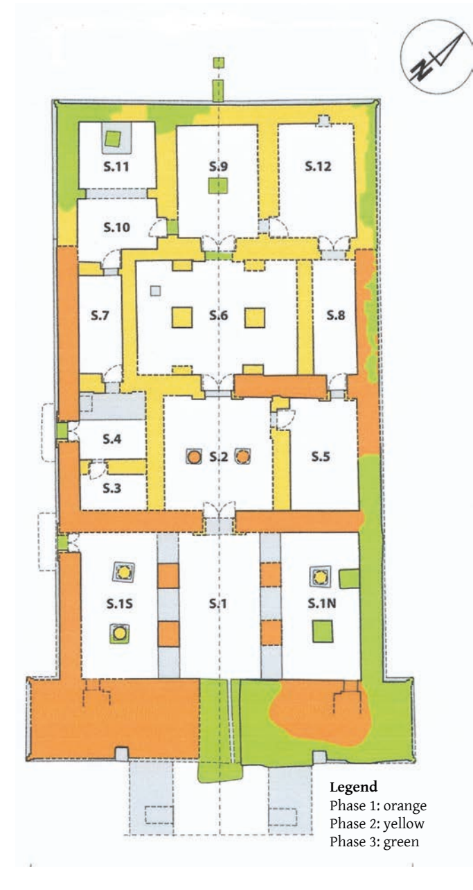
Figure 1. Vestiges of the temple in its different phases.

Excavations at the Amun Temple complex in el-Hassa first began in 2002. They were funded by France's Ministry of Foreign Affairs. For 16 years, they were conducted by a team<sup>1</sup> led by Vincent Rondot, assisted by Giorgio Nogara, Field Director since 2014. Now that work has been completed, the site may be presented to its best advantage. Descriptions of the building's architecture and the information these provide about its history have either already been or will later be published (Rondot 2012; Rondot and Nogara 2019). From analysis of the foundations and the vestiges of the walls, three distinct phases could be identified, referred to as 1, 2 and 3, each corresponding to a different stage in the building's architectural development (Figure 1). In simple terms, Phase 1 was the period when the temple was built with its dromos and ceremonial palace, Phase 2 was when it was extended and the ceremonial palace slightly altered and Phase 3 was when it was crudely restored after a period of unknown duration during which the site was left abandoned and most of the walls collapsed. The architectural features corresponding to these different stages are a source of valuable information about Meroitic religious architecture and its links with its Egyptian equivalent. The other most important factors emerging were: