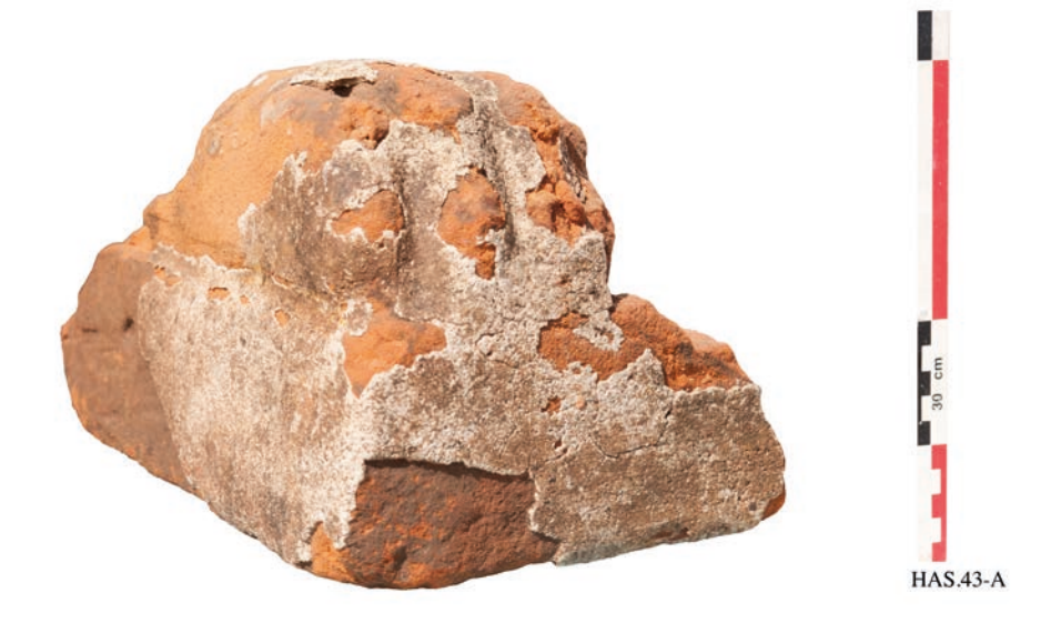
Figure 3. Traces of white mortar on a sandstone lion's paw.