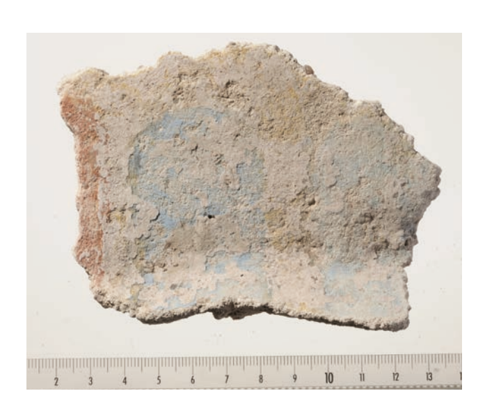
Figure 7. Fragment of render on a cornice coated with limestone wash (Phase 3).