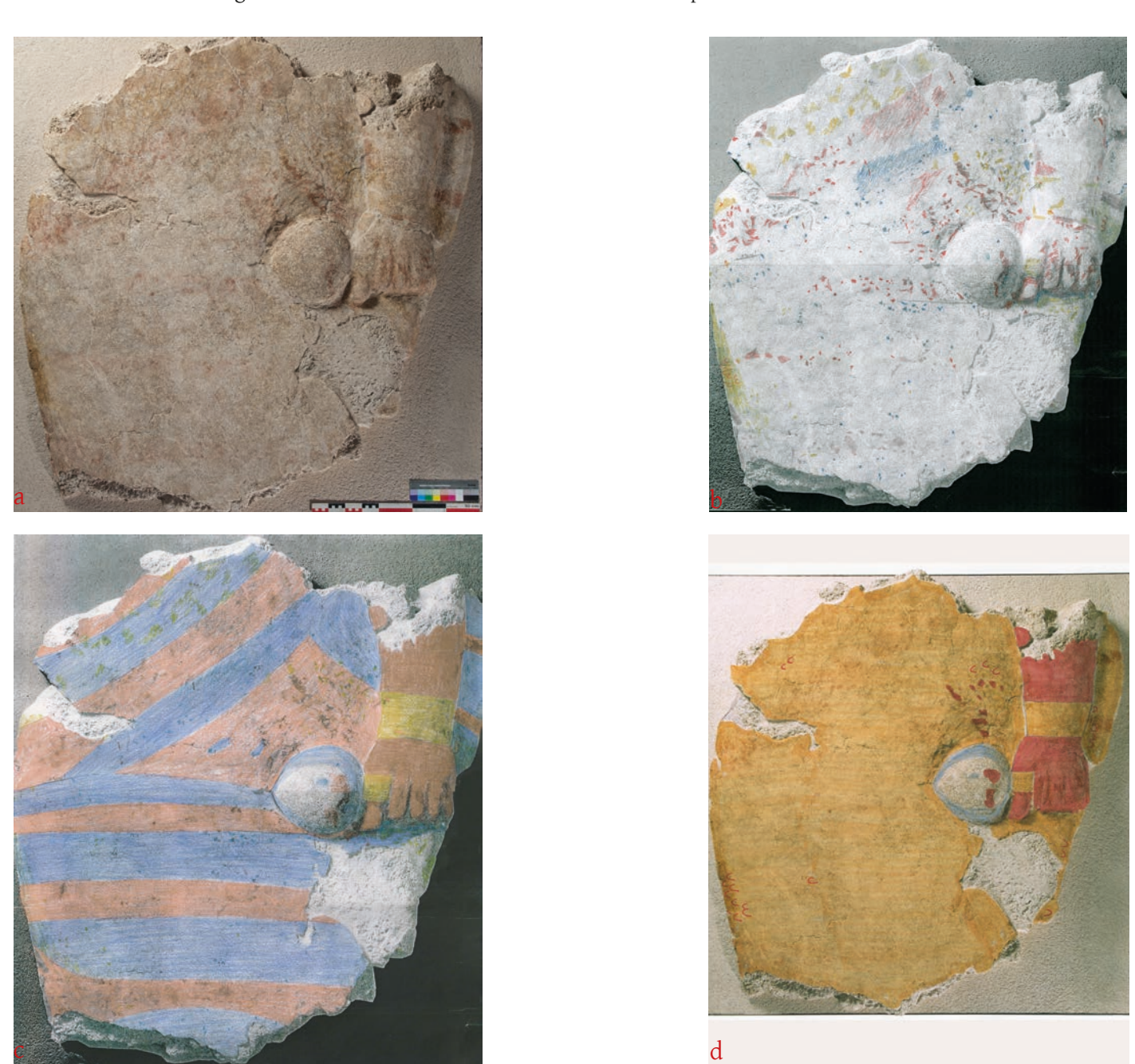
Figure 4. Bas-relief of mortar representing the pelvis of a Candace; a) after restoration; b) traces of paint; c) restoration of the decoration in Phase 1; d) restoration of the decoration in Phase 1.