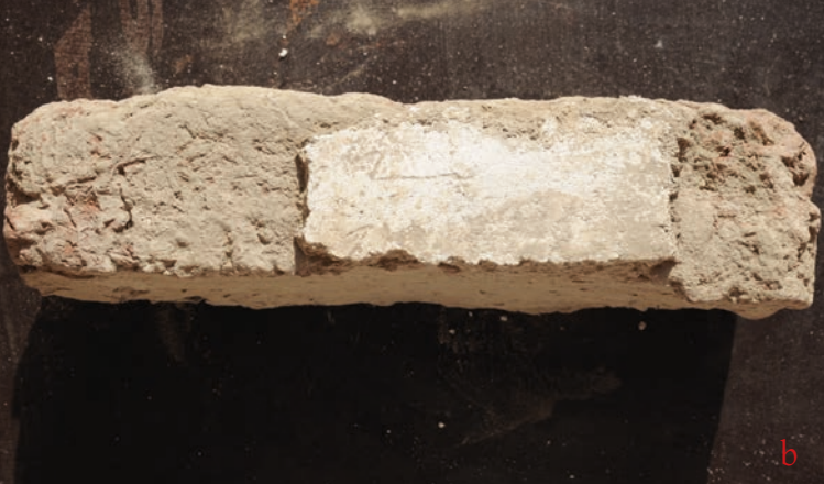
Figure 9. Illustration of the two painting techniques used. a. Paint applied on dry render. b. Polished paint on wet render.