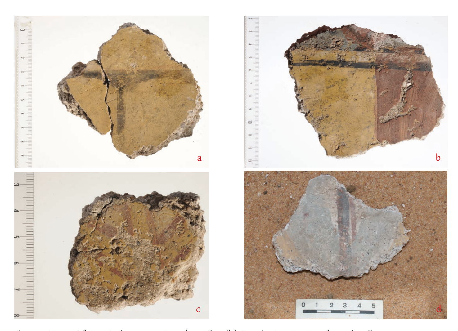
Figure 6. Decorated flat render fragments. a. Temple: north wall. b. Temple: Room 8. c. Temple: north wall. d. Ceremonial palace.