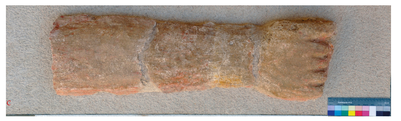
Figure 5. Fragments of mortar shaped to represent parts of the human body. a. Lower part of the face of a royal figure. b. Part of a torso. c. Arm reconstituted from four fragments.