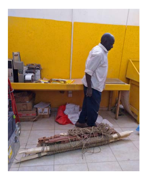
Figure 23. Rolled up bed in the DHL branch in Khartoum, 2019.

Ancient bed legs were sometimes placed on stone cones to lift them off the floor for the same reasons (Peet and Woolley 1923, pl. 14, no. 2). Local schist stone might have been used for the same purpose in the houses of Amara West; in Tomb G301 wooden coffins were placed on schist slabs to raise them off the burial chamber floor (Binder et al. 2010).