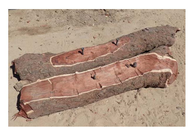
Figure 8. Red-brown sunut wood, Acacia nilotica, Dom 2018.

(Acacia nilotica), the red-brown colour of its interior allowing interesting patterns and contrasts in the finished angareeb (Figure 8). The wood from this tree has few long straight elements, and as it is harder than neem is sometimes softened in water before it is worked, or is worked green. When the wood dries, the surface often cracks. To avoid this the wood is buried in sand to slow the drying process, which can take up to three months. Another acacia used is haraz or hurug (Faidherbia, formerly Acacia albida). This wood (Arabic: حراز) Nubian: (Acacia albida). This wood (Arabic: حراز) Nubian: (Acacia albida) strong and easy to shape. However, it is hard to