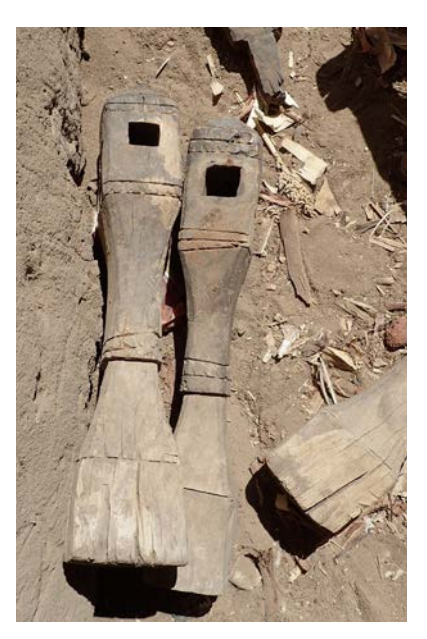
From top left: Figures 13 a-e. Different modern leg decoration found in Nubian villages Sabo, Selem, and Magasir 2018.