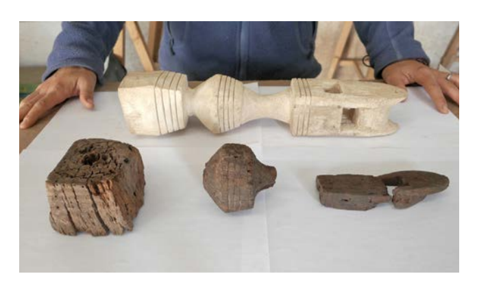
Figure 3. From the ancient fragments (darker brown) to a modern reproduction. Amara West Research Project house, Ernetta 2018.

As study of the extremely fragmentary ancient fragments (Figure 3; Lehmann 2021b) progressed, it became clear how informative more recent beds, specifically those made with wooden frames, could