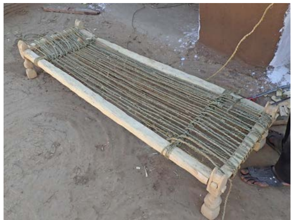
Left: Figure 16a. Starting the warp on the normal bed. Ernetta 2019. Right: Figure 16b. Finishing the warp for the travel bed. Ernetta 2019.

secure the joints small wooden wedges (takki عن) are inserted and hammered into the gaps. In total, the frame, legs and assembly took around one and a half days, a total of about 12 hours.