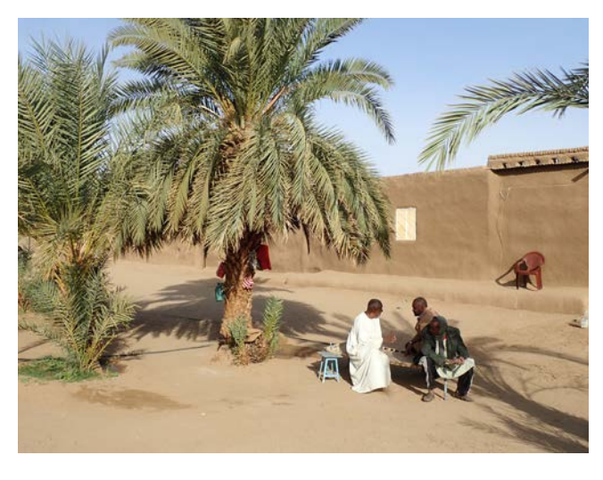
Figure 4. Angareeb bed outside a house. Ernetta 2019.

be for our understanding of the construction techniques and possible uses. While modern Nubian angareeb beds are ubiquitous in and around houses in Nubian villages (Figure 4), this important item of furniture, and its production and use, has been little researched. Therefore, an ethnoarchaeological research project was instigated in 2018. Of course, the social, cultural and religious context of the bed's meaning and use probably differed enormously between late 2<sup>nd</sup> millennium BC Kush and present-day northern Sudan, but as with other ethnoarchaeological research, continuities of material use and production technique, within a similar environmental context, can prove informative (Wendrich 1999, 18). The principal difference was the use of iron tools by modern carpenters. Ethnoarchaeological research has also provided insight into other strands of the Amara West Research Project (Dalton 2017; Ryan 2016).