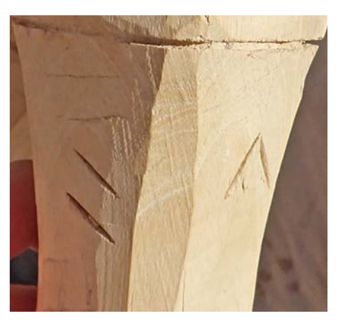
Left: Figure 14a. Banbar legs with workmen's marks. Dom 2018. Right: Figure 14b. Detail of workmen's marks.

production are tenon holes chiselled into the top (Figure 12b). This can lead to breakage of the surface on the edges of the tenon hole, which we also see on some ancient fragments. This whole process takes around 45 minutes to one hour for one leg, though the modern banbar stool was much quicker given the simpler form and lack of decoration. Throughout, Mustafa worked in a seated position, using his feet to keep the object in position while his hands worked the bed with the tools.