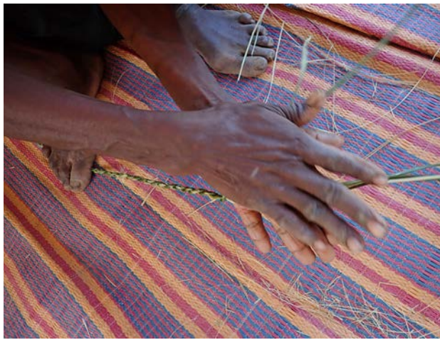
Left: Figure 9a. Making the stringing from halfa grass fibres with liffa bundles in the background. Ernetta 2019. Right: Figure 9b. Twisting the fibres with both hands. Ernetta 2019.