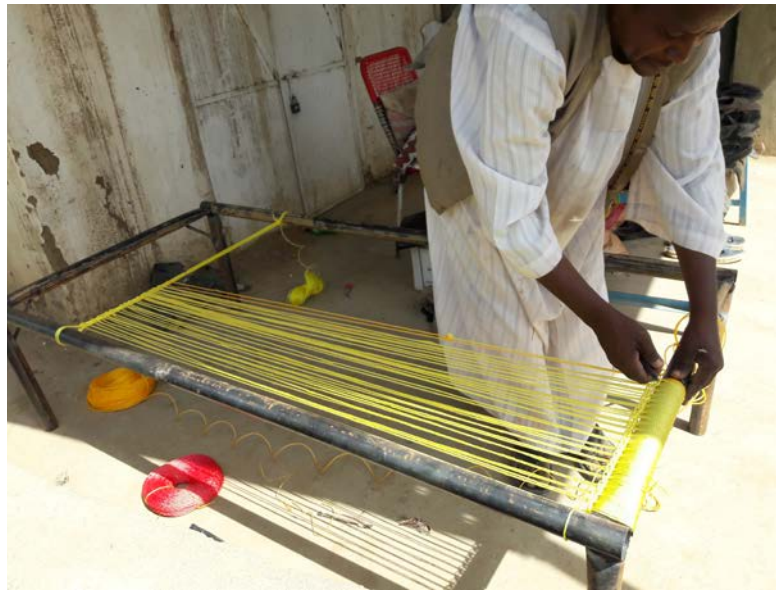
Left: Figure 2a. Traditional wooden angareeb bed with plant stringing. Magasir 2018. Right: Figure 2b. Modern bed with metal frame and nylon stringing. Abri 2018.