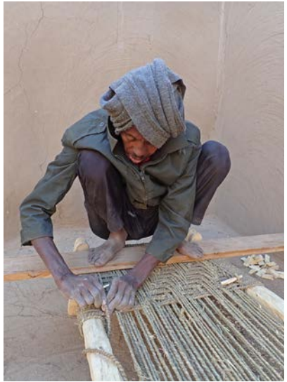
Left: Figure 17a. The warp attached around the frame. Ernetta 2019. Right: Figure 17b. Working position while weaving the lying surface. Ernetta 2019.