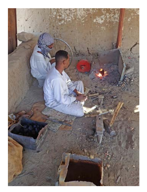
Figure 21. Repair and sharpening of tools. Abri 2019.