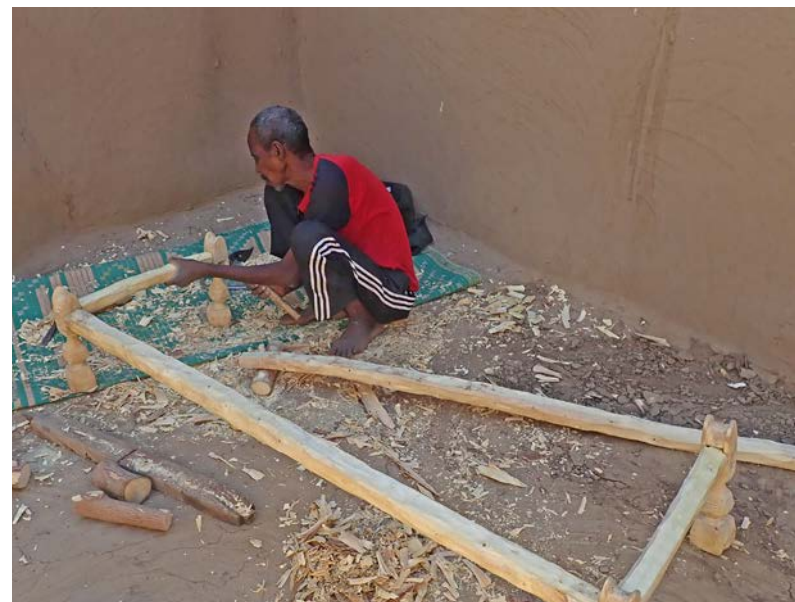
Left: Figure 15a. Creating a meriq -plank for the bed frame. Ernetta 2019. Right: Figure 15b. Assembling the bed frame. Ernetta 2019.