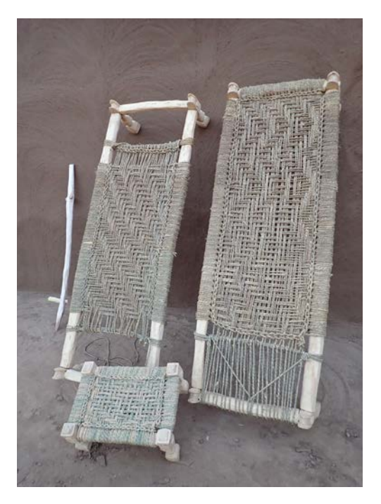
Figure 1. Two beds and a stool made by Mustafa. Ernetta 2019.