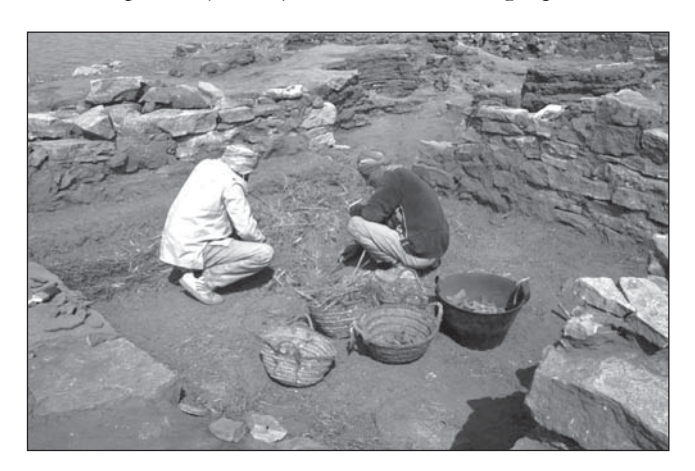
Plate 3. Excavation of organic layers [QI00 2/36].

Only a small part of the building has yet been excavated. A small 'room', roughly 6m square, was investigated. It was found to have no doors, a poorly preserved rough mud floor, and unlike the neighbouring rooms, its walls were unplastered. These features suggest it may have been a light well for a building of more than one storey. By the Meroitic period, however, the room had gone out of use, and masonry from the walls had fallen into it. Over the rubble had accumulated thick, evenly bedded deposits of the late Meroitic period (Plate 3). These included large quantities of