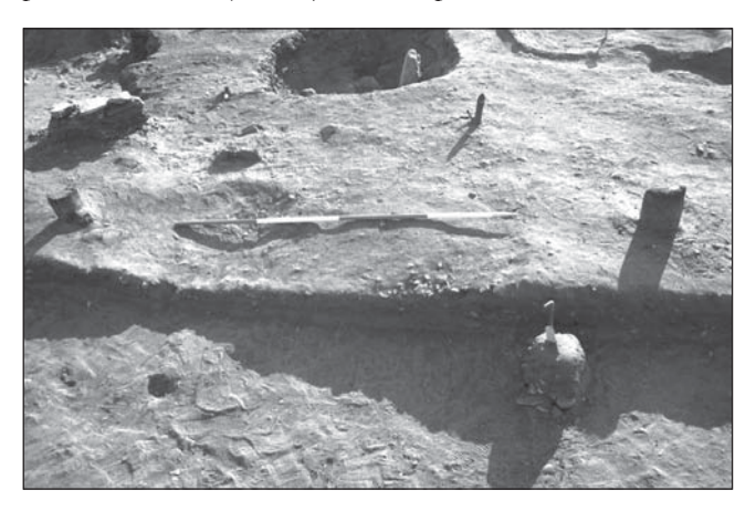
Plate 1. Wooden posts in situ [QI00 3/32].

The terracing fill does not appear to have been laid down in a single event. Changes in the nature of the fill making up the terrace, and various activity surfaces low down within the fill, indicate that it built up in phases, although all within the early Christian period. Thus, within the fill, were arrangements of post-holes, some with the lower part of the posts still in situ (Plate 1). A small pit full of crushed radish