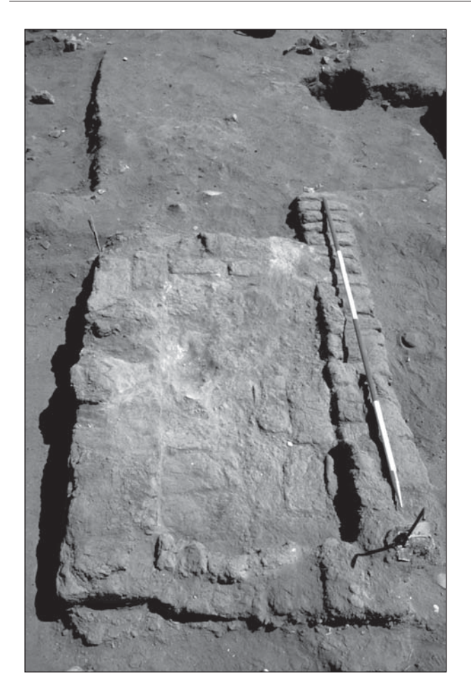
Plate 2. Burnt mud-brick feature [QI00 11/10].

stantial stone feature were found under the early Christian fill. This was a wall-like construction of large unshaped stones, which were laid in rough courses. These appear to stand on a shallow base of flat slabs, but insufficient of this is yet visible to make this certain. The feature ran east-west and extended from close to the western edge of the site for some 5m, where it was truncated by a pit and disappears. As preserved, it is some 1.5m thick and terminated on the northern side against a shallow gebel cut. The few sherds found amongst the stones are of Meroitic and earlier date. This feature remains to be further investigated in future seasons.