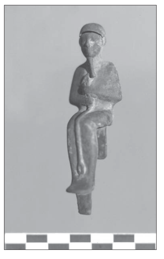
Plate 4. Bronze figurine of Ptah [QI00 FCS2/14].

To the east, excavation concentrated on the area linking the stone building with Temple 6. In the small area so far uncovered a complex sequence of building activity has been revealed, though as yet it is not possible to make sense of it. All the activity here is pre-Meroitic and pre-Roman in date, although the precise chronology and duration of the occupation have yet to be established through the study of the pottery and other finds. Three aligned but flimsy mud-brick walls run into the robber trench left by the removal of the south wall of the stone building, and were on a different orientation to it. East of these, and running under Temple 6, was a thick redeposited layer of soft sandy fill which contained a rich selection of finds. These included many fragments of papyrus inscribed in hieratic, amongst which were two complete folded documents, one of which had a seated figure of a lion-headed god or goddess drawn on it. Bronze