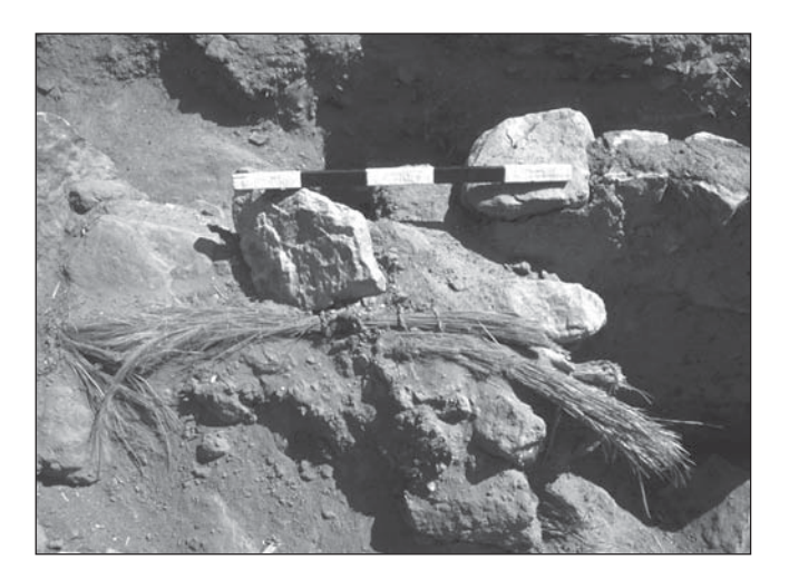
Plate 5. Bundle of halfa grass, possibly from roofing [QI00 7/10].

contemporary, but were clearly added to and modified over time. However, all the walls are heavily mud plastered, and the surviving plaster makes phasing the sequence of construction difficult. An unusual feature is what appears to be a small niche or cupboard in one wall of what appears to be the earliest of the structures, floored by a large, reused, piece of wood. In the rubble overlying this area were bundles of halfa grass loosely tied around with string (Plate 5). They