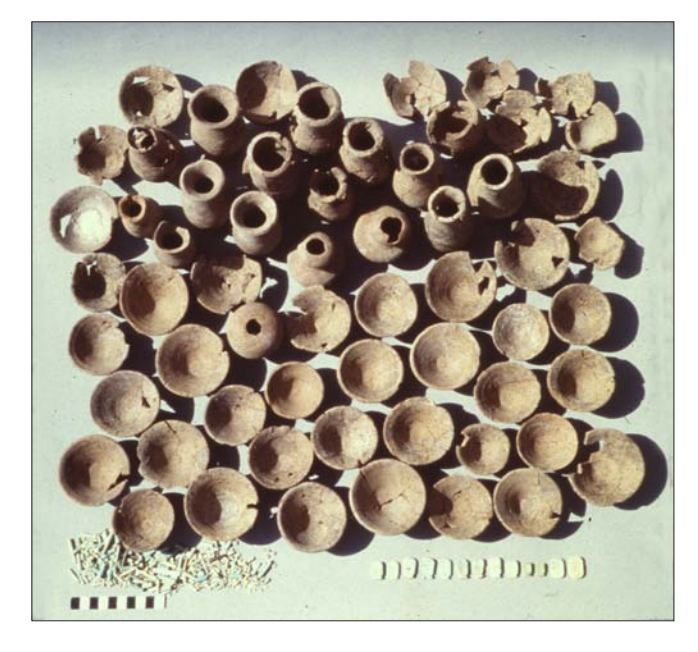
Plate 2. Foundation deposit of the temple of Thutmose IV.

palace, undoubtedly built during the 18th Dynasty, was particularly spectacular (Plate 1). It measured nearly 40m in length and was between 4 and 5m wide. The study of two new foundation deposits has completed the analyses of the preceding season's finds (Bonnet et al. 2001, 209-10, fig. 10) and has allowed us to attribute the construction of the earliest temple to Thutmose IV (Plate 2). During the reign of Akhenaton, the building was destroyed in an almost systematic fashion (Colour plate XVIII). A Meroitic well, discovered last year (Bonnet et al. 2001, 212, fig. 12) and excavated to a depth of 2m, was found to be at least 7m deep. At the bottom was found an older structure with a slightly smaller diameter (Colour plate XIX).