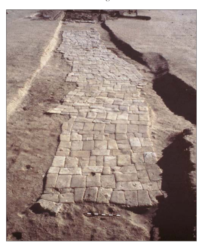
Plate 1. Ceremonial way leading towards a palace of the Egyptian town (Kerma – Dokki Gel – 2002).

The excavations at Dokki Gel yielded a wealth of information on the New Kingdom occupation. The uncovering of a ceremonial avenue leading towards the remains of a