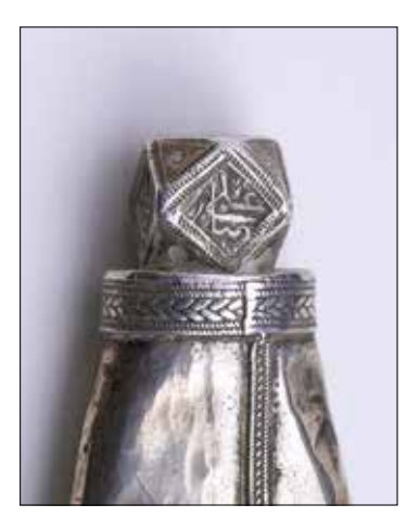
Plate 20. Silver chape stamped with the name Abd Al-Rashid, MacMichael sword (Private collection).