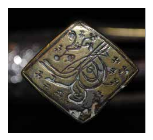
Plate 14. Inscribed quillon end bearing the reversed tughra of Sultan Ali Dinar, MacMichael sword (Private collection).

The other quillon is incised with the tughra of Sultan Ali Dinar. It appears reversed, mirror-image (Plate 14). There are four inscriptions on the blade, two on either side, separated by the stamp mentioned above. The two closest to the cross-guard are engraved on the ricasso and run beneath the languet of the cross-guard, while the remaining two are reverse acid etched in panels lower down. The acid etched