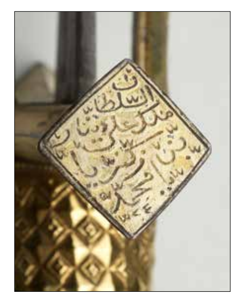
Plate 8. Inscribed quillon end of British Museum sword (Afl 1932,1014.1).

[Blade?] belongs to the Sultan Ali, son of Zakariyya. Oh Muhammad