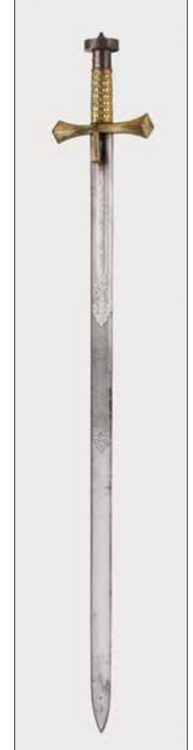
Plate 1. British Museum kaskara sword (Afl 1932,1014.1) (photo: © Trustees of the British Museum).

The source and etymology of the word 'kaskara', the name by which this type of sword is referred to in literature, are not known. It does not appear to be a Sudanese or Arabic word. The origin of the kaskara sword itself is also unclear. Their form appears to be somewhat like that of Crusader swords, but there is little evidence to support a direct relationship and the distance both in time and in space between the kaskara and the Crusades is considerable making