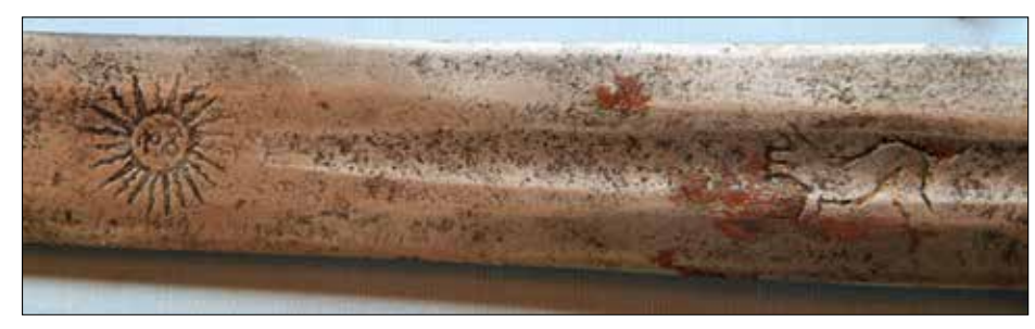
Plate 4. Stamped marks on the blade of King Nasir Mohamed (KH 394). A sun and the running wolf of Passau.

of the fuller and precedes the Arabic inscription (Plate 4). The stylized quadruped is the running wolf of Passau (Wagner 1967, 109). Assuming the stamp is original, it indicates that this blade comes from Germany, likely from Solingen, and could be dated to the 17<sup>th</sup> century (Reed 1987, 168; see also Atkinson 2016, Marks and Stamps). By the late 19<sup>th</sup> and early 20<sup>th</sup> centuries, blades were (and still are) manufactured locally in places such as Kassala as mentioned above; however, imported blades were preferred because those locally made tended to be brittle and break easily (Hunley 2010, 39).