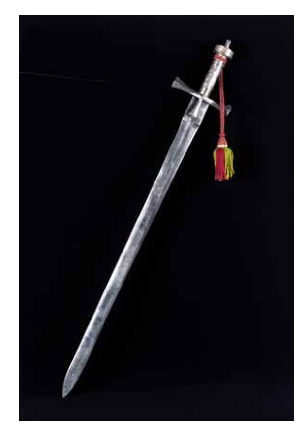
Plate 2. Sword of King Nasir Mohamed (KH 394).

The sword of Nasir Mohamed, now in the Sudan National Museum (KH 394) (Pearce et al. 2004, 245, no. 217; Anderson and Abdelrahman Ali Mohamed 2013, 107) may illustrate this international trade in blades (Plate 2). Nasir Mohamed was a king of the Hamaj and Regent during the Funj Sultanate in the mid-18<sup>th</sup> century (AD 1787/8-1792/3).<sup>5,6</sup> The capital of the Funj Sultanate was at Sennar situated approximately 250km south of Khartoum on the Blue Nile although the exact provenance of this particular blade is unknown. The sword has a steel blade and cross-shaped guard with flaring quillons, and a silver handle with disc-shaped pommel. The handle is embellished with twisted silver wire and adorned with a silk tassel through which threads of silver have been woven. The blade has a single shallow central fuller and is 880mm long while the handle reaches nearly 160mm, so