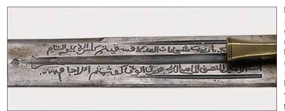
Plate 17. Engraved inscription on the reverse face of the MacMichael blade (Private collection).

The acid etched inscription that follows below (Plate 18) appears to read: