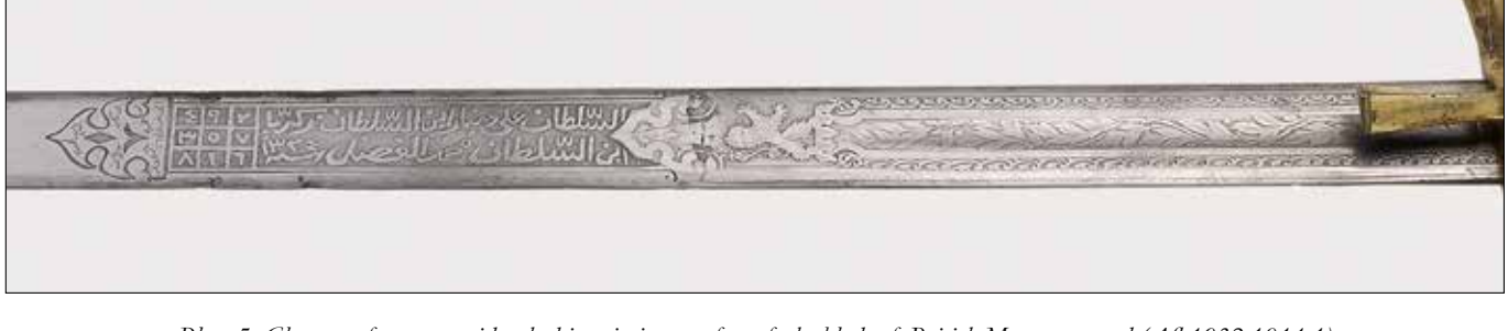
Plate 5. Close-up of reverse acid etched inscriptions on face of the blade of British Museum sword (Afl 1932,1014.1) (photo: © Trustees of the British Museum).

British Museum sword (Af1932,1014.1) is a double-edged steel broadsword with a cruciform hilt and a single wide fuller. It reaches a total length of 1.09m, with the blade itself being 934mm long. The blade is of European origin and the third nearest the cross-guard is decorated with a serious of foliate patterns, a lion rampart, and finished with a fleur-de-lis type ornament towards the distal end, all created by reverse acid etching (Plates 5 and 6). Both faces contain texts in panels that have been added later, situated roughly halfway down the blade, again using reverse acid etching. These secondary inscriptions complimented the original decoration by duplicating the fleur-de-lis type ornament at the distal end of the inscription. This ornament also resembles and may allude