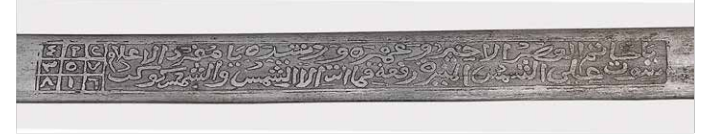
Plate 16. Reverse acid etched inscription on face of the MacMichael blade (Private collection).

Oh Ali. [You] visited the enemies' places and the enemies drink death from your powerfulness. You are the Prince. You protect the war. He who is in the war is very brave and great. 1322 AH. [AD 1904]