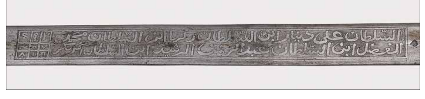
Plate 18. Engraved inscription on the reverse face of the MacMichael blade (Private collection).

ally European) or local imitations of such; local sword marks; foreign and local engraved or etched inscriptions, and added talismans or magical symbols. As such, though complicated and difficult to fully understand, they provide valuable historical documentation particularly in this instance, for the reign of Sultan Ali Dinar.