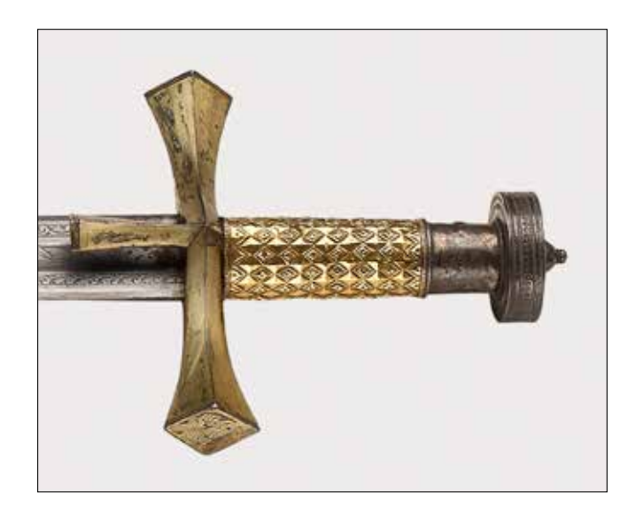
Plate 7. Cross-guard and pommel of British Museum sword (Afl 1932,1014.1) (photo: © Trustees of the British Museum).

This inscription is followed by a 3 x 3 magic number square (wafq):