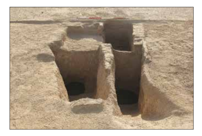
Plate 6. Two tombs under pyramid superstructure BMC 43.

The recent archaeological results from the Kushite cemetery at Berber provide valuable information and highlight the importance and significant location of this region. It occupies