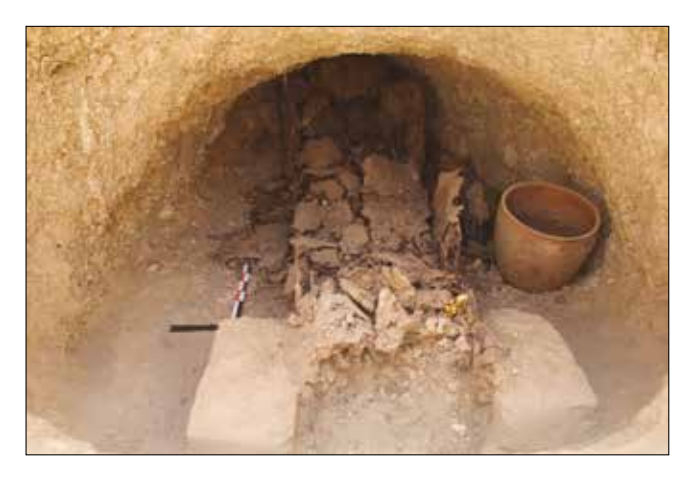
Plate 3. Wooden coffin in BMC 44 and part of the blocking wall around it.

This tomb had no superstructure preserved and it is located in the middle of area A in the factory plan (Mahmoud Suliman