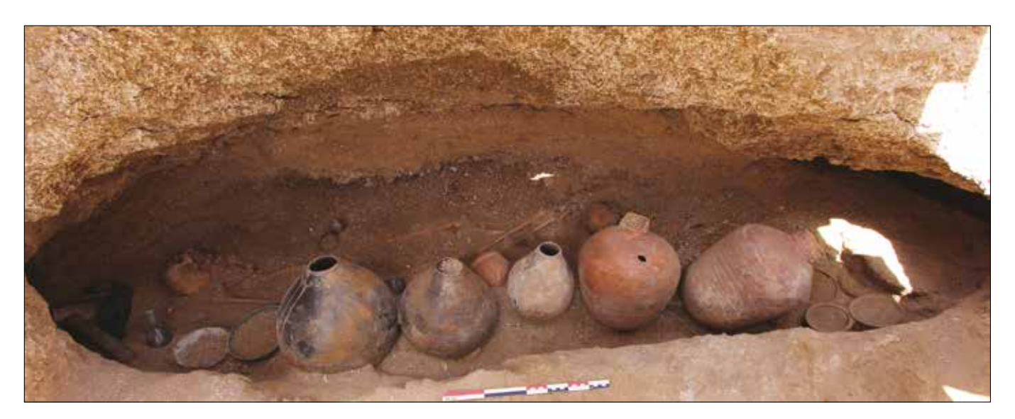
Plate 5. The rich burial in BMC 53.

and one small globular handmade black cup along with two wheel-made jars, one painted on the shoulder, a painted bowl and ledged rim bowls.