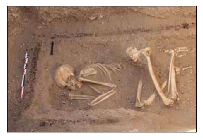
Plate 2. The skeleton in BMC 57.

The skeleton in semi-flexed position on the right side was found oriented west-east, the head to the west facing south. The hands are in front of the face, the right hand being very close to it (Plate 2). The left leg rested on the right one. It is clear that the body lay on a wooden bed; the remaining parts of the bed frame measured 800mm in width, and 1.38m long,