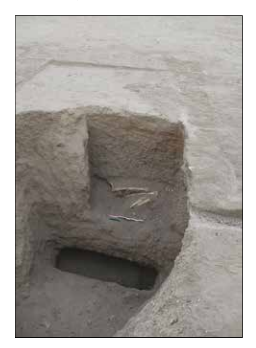
Plate 1. BMC 39a and b.

A second tomb was found over the western end of the burial niche where its fill was observed (Plate 1). Remains of wood, probably parts of a bed, were found in the fill at the depth of 800mm. In the south-west corner was a pottery jar found at a depth 640mm from the surface of the superstructure. This corner also contained large pieces of wood. Within the jar were remains of seeds and two iron rods. These are probably the remains of tangs from spear or arrowheads. Under this level at the depth of 1.2m we found a skeleton in flexed position oriented east-west, the head to the west facing north, the right arm flexed and placed across the left one near the distal end; the left hand rests in front of the chest. There were traces of vellow ochre in the south-west corner. In front of the body were two small pottery bowls and a third of copper alloy. A piece of faience inscribed with the name of Shabaqo was found near the ankle of the body.