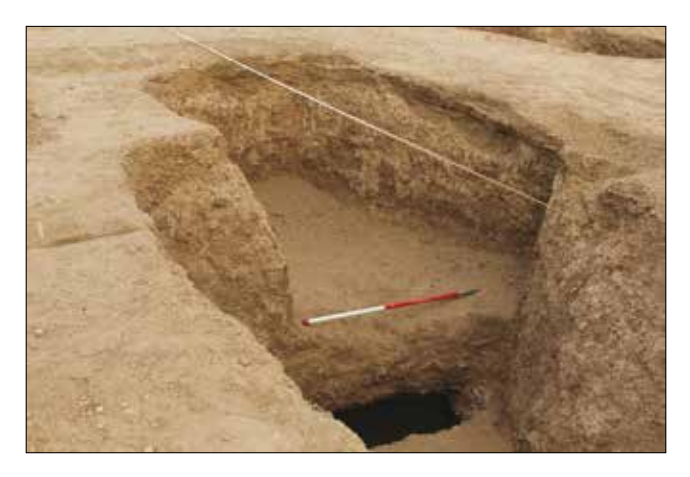
Plate 7. Two tombs beneath pyramid BMC 39.

the area north of the Island of Meroe, and is south east of the major Kushite sites around Napata as well as those much further to the north. It lies at the point where there is the shortest route between the river and the Red Sea in the whole Nile Valley. This geographic position placed the region at a cross-road in the network of trade during the Early Islamic