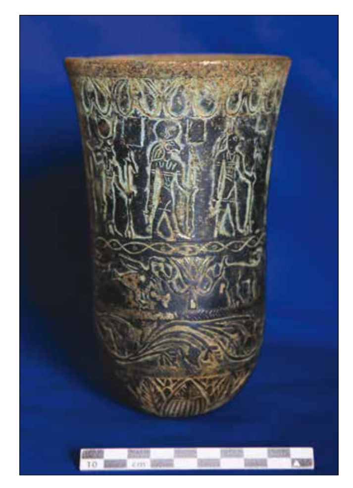
Plate 4. Deep copper-alloy beaker decorated with reliefs.

Bashir 2010, 69). The main reason to excavate this tomb was because the rain water of summer 2015 had caused a partial collapse of the chamber.