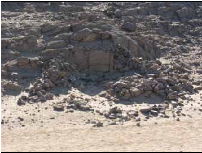
Plate H.1. Site 4-H-7(14) hut, type SS06a.