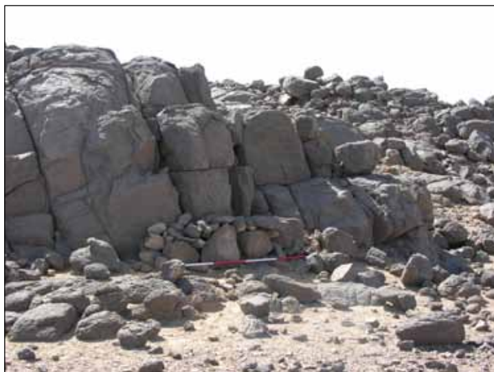
Plate H.4. Site 4-H-14, general view before excavation.