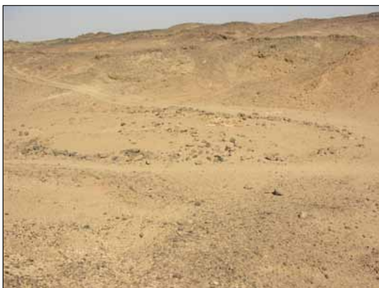
Plate H.6. Site 4-H-27(1 and 2).