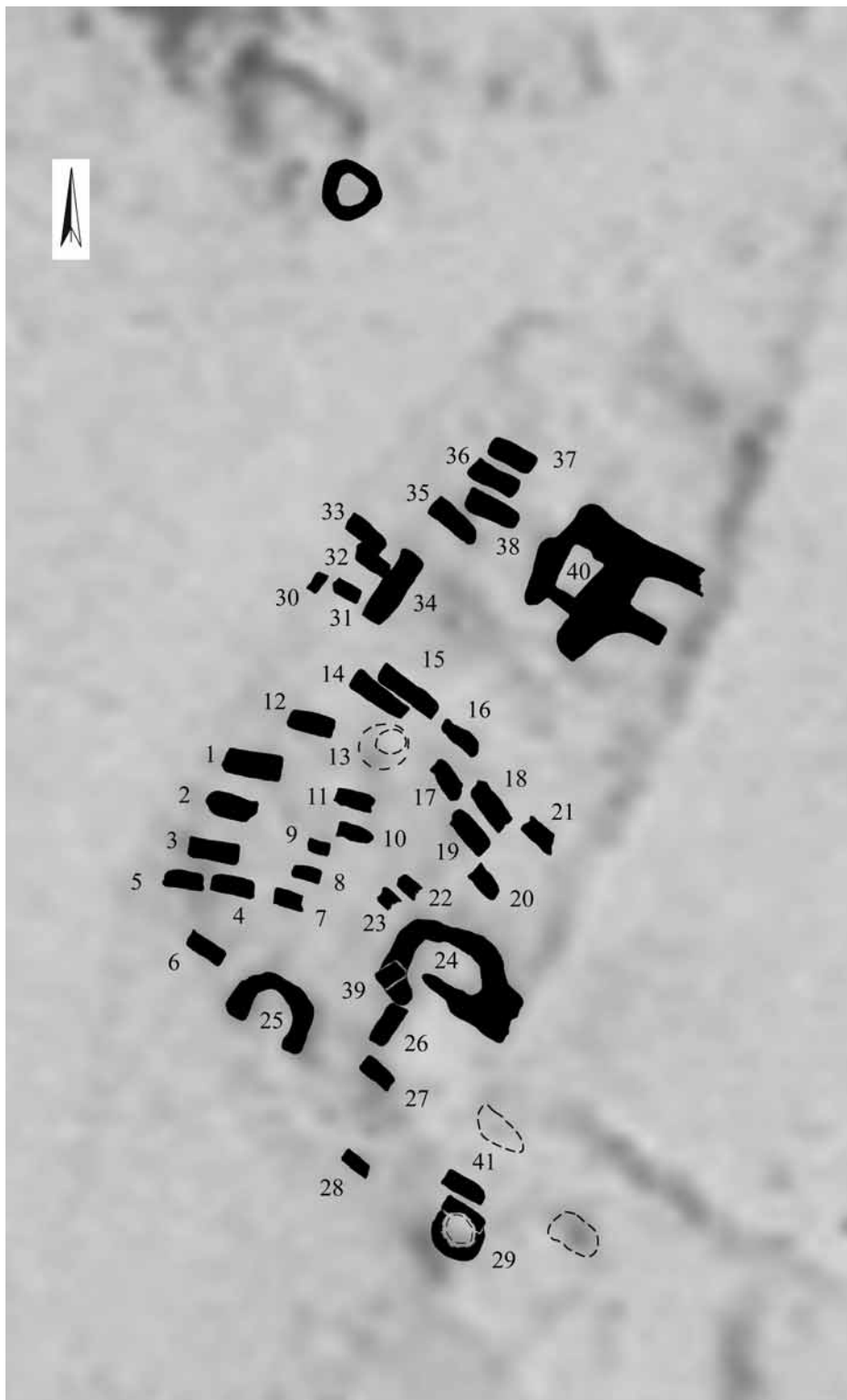
Figure H.5. Site 4-H-32 (scale 1:250).