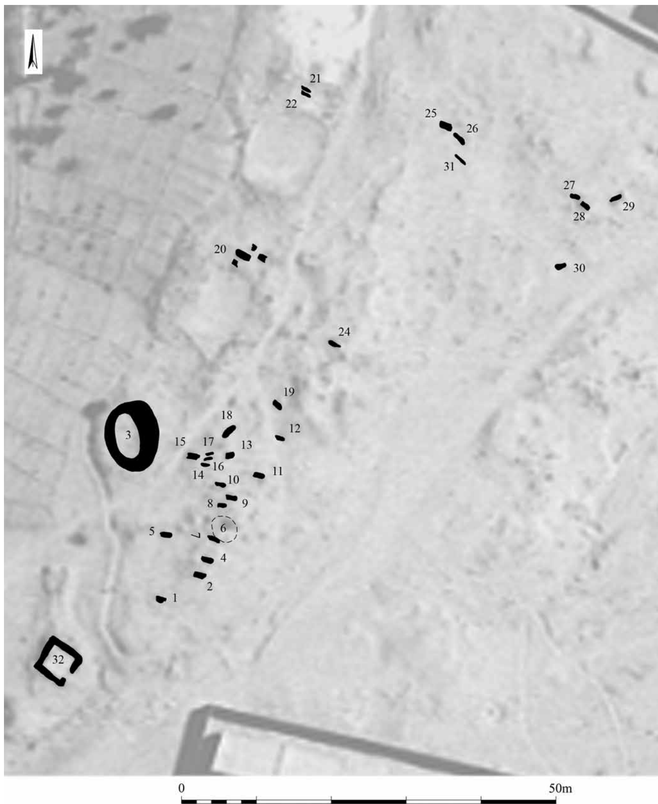
Figure H.6. Site 4-H-408 (scale 1:500).