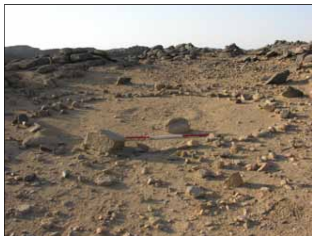
Plate H.8. Site 4-H-29(8) setting, type CS03.