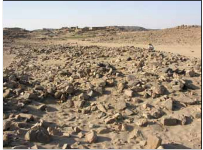
Plate H.10. Site 4-H-32.