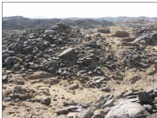
Plate H.7. Site 4-H-29.