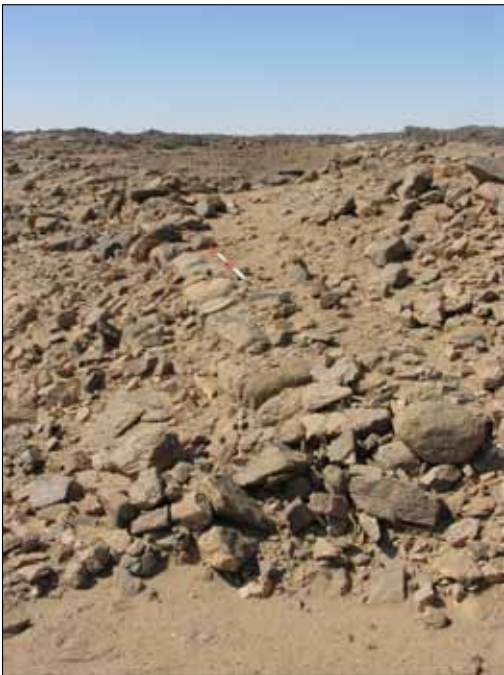
Plate H.3. Site 4-H-12, the pathway (7).