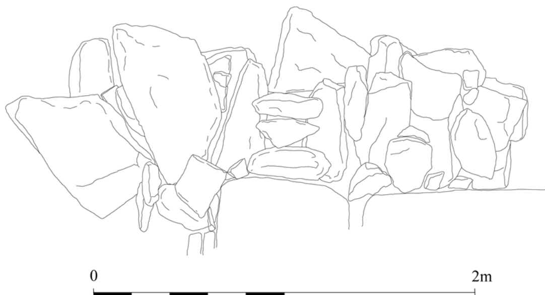
Figure H.3. Site 4-H-14. Plan of the grave cover slabs (scale 1:20).