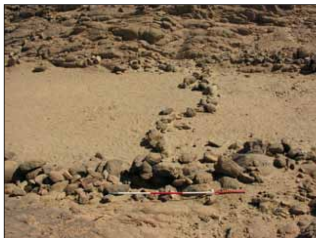
Plate H.13. Site 4-H-69 walls, types LN01a and LN01b.