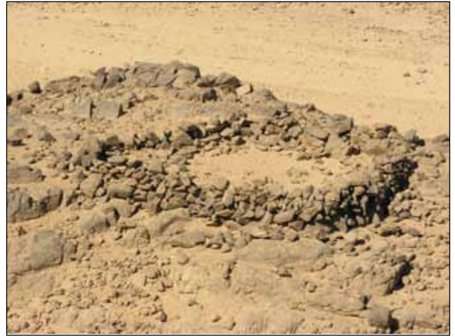
Plate H.2. Site 4-H-9(1-2) huts, type SS06a.