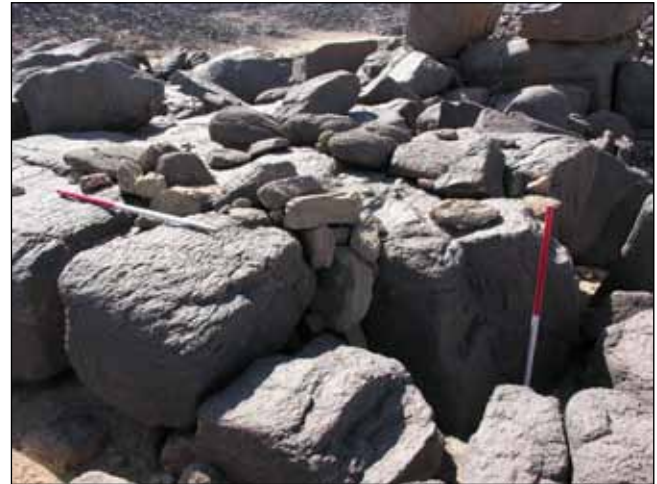
Plate H.12. Site 4-H-49(2-3) crevice graves, type FR02.

Site code: 4-H-46 Site type: Rock art Motifs: quadrapedes