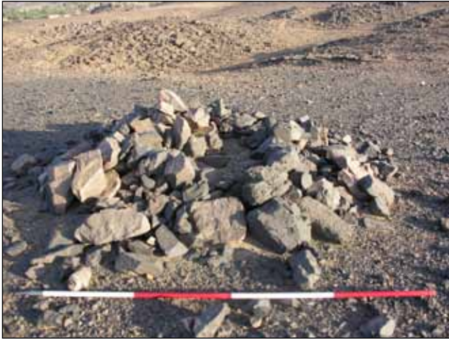
Plate H.11. Site 4-H-42(1) tumulus, type FT04b.