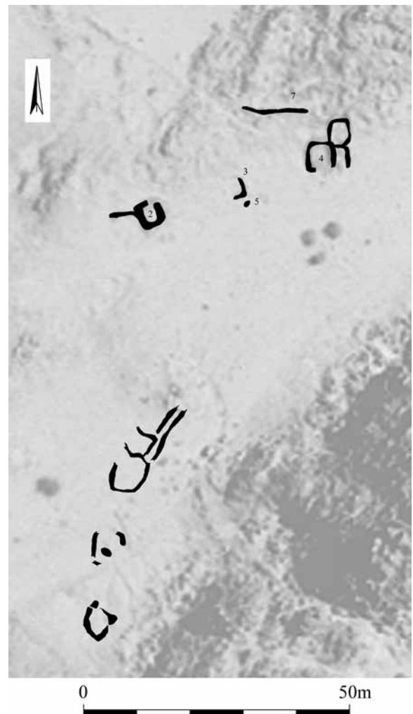
Figure H.2. Site 4-H-12 (scale 1:1000).

Max. dimensions: 2.3 x 1.9m Minimum number of features recorded: 1