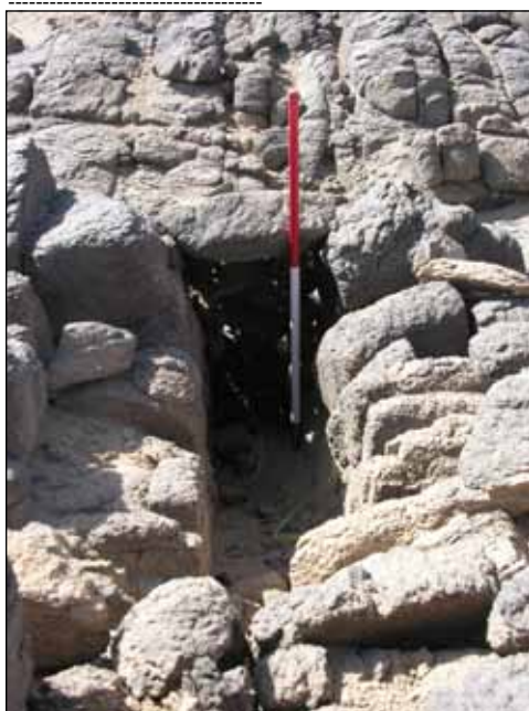
Plate H.5. Site 4-H-22(3) crevice grave, type FR01.