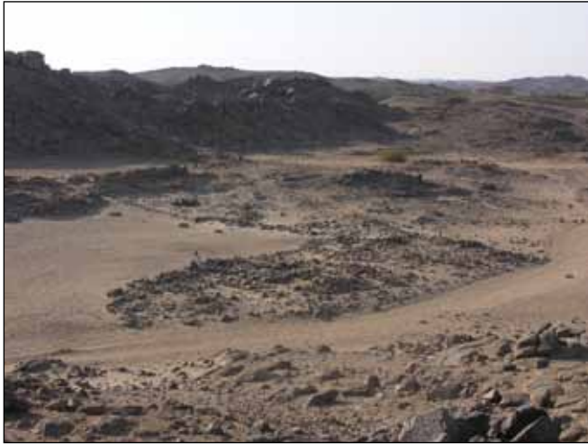
Plate H.9. Site 4-H-32, general view.