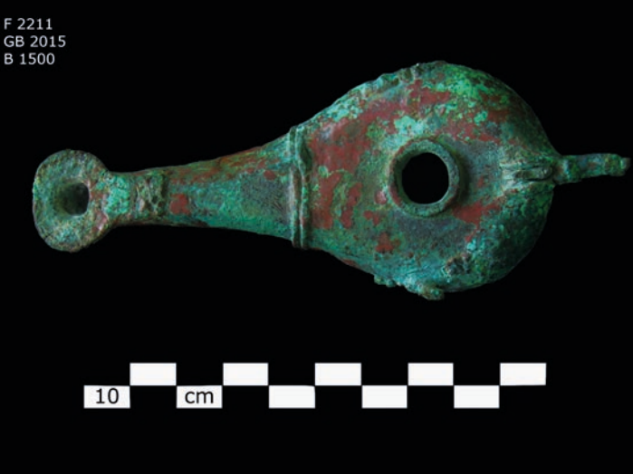
Figure 5. 3D model of the lamp after restoration (illustration Figure 6. Scale photo of the lamp. Silvia Callegher).