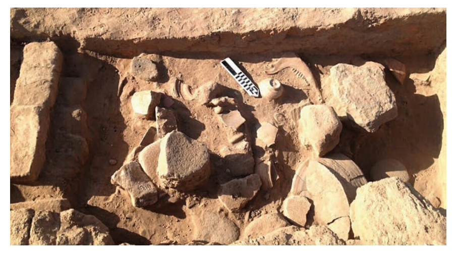
Figure 3. Deposit where the lamp was found.

in bronze lamps, for the small supply hole to be protected by a lid but unfortunately in this case it was lost. There is one round spout and a ring base. The handle is rather damaged, but from what remains we can deduce it was likewise a ring. On the basis of some comparisons characterised by leaves, palmettes, lunar crescents or even more complex motifs, it can be assumed that the handle of our lamp could also have been decorated.