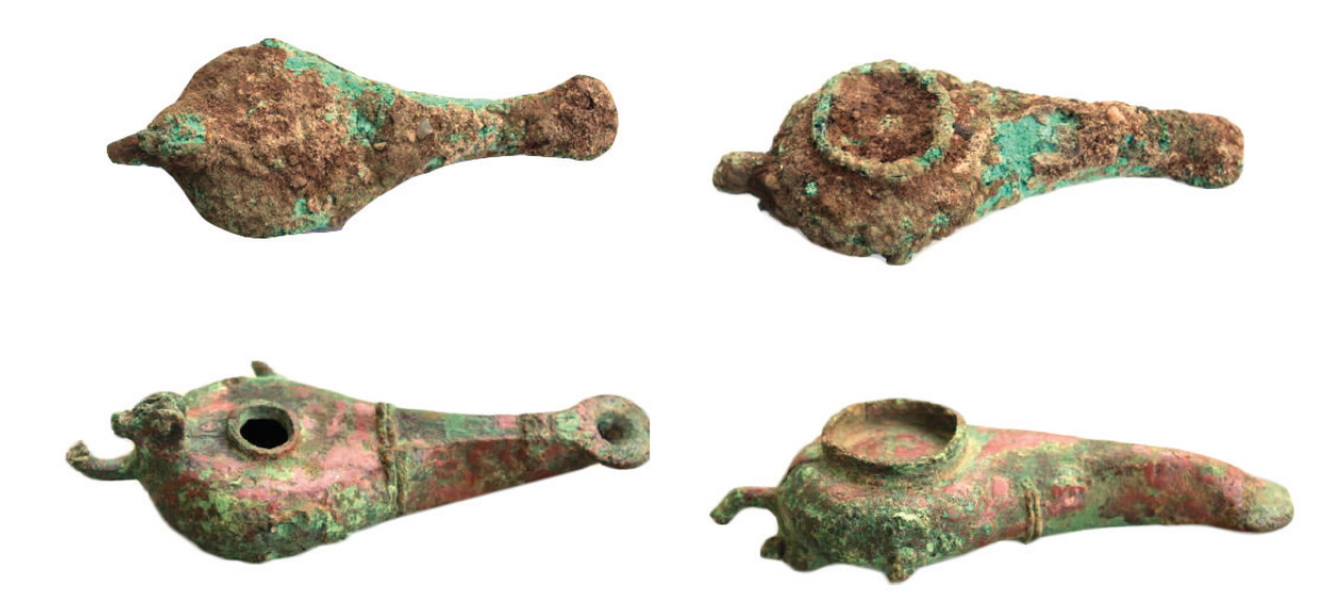
Figure 4. The lamp before and after restoration.

It has been suggested that copper was present in Nubia in the areas of Tombos and Kerma; in the latter, particularly, a bronze-maker's workshop dating from the Middle Kerma period was found, mainly used for the production of knives and daggers (Bonnet 1986, 19-21).