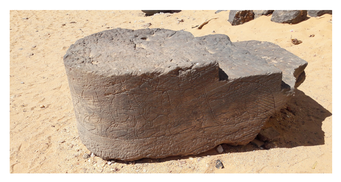
Figure 4. View of the throne pedestal at Jebel Barkal, with decoration of bound prisoners (photo K. Kroeper).

On the other hand, a throne pedestal of the ruler within the temple building itself, as in any other temple, makes little sense because it is Amun who rules here and not the king who performs sacrifices to him. The throne pedestal is clearly, made for a chair or stool, i.e. the throne of the king, which was reached by two or three steps, and probably situated under a canopy. Since this canopy most probably consisted of organic material and was most likely placed there only temporarily, no evidence of one has been found. From here the king examined and supervised work in progress, and moreover this place served as the beginning of all cultic actions within the respective temple. Because the king does not squat on the ground but sits enthroned on a chair, he does not run through sand, mud or thorns to come to the respective temple in order to perform the necessary ritual actions that he needed to accomplish. Instead he was carried on his throne, as one who is always carried, to the throne pedestal. There in the holy district he can rise and walk to enter the temple. This explains the idea of the walk of the king, which was a sign of his still-existing strength and ability to continue to exercise his office, as e.g. in the Heb-Sed festival – because, externally, the ruler appears as one always carried and not as one who himself runs to and fro between the temples and sacrificial places. If this would have been the case, a 'show run' of the king would hardly be of interest.