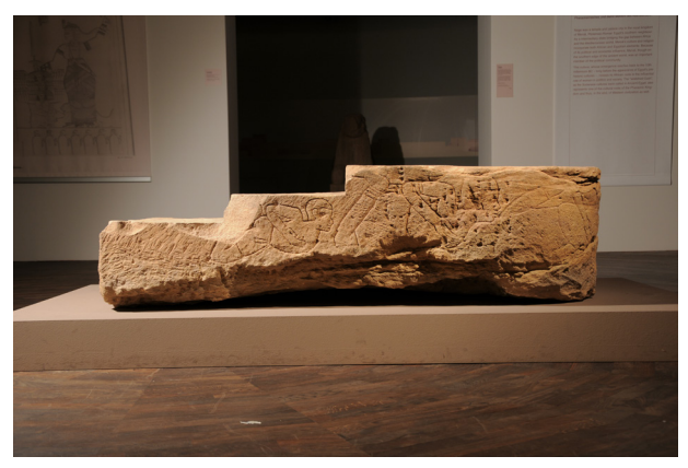
Figure 3. View of the decoration of the Throne Pedestal 170, with a surrounding decoration of bound prisoners. The pecked area at the bottom indicates to which level the pedestal was invisible.