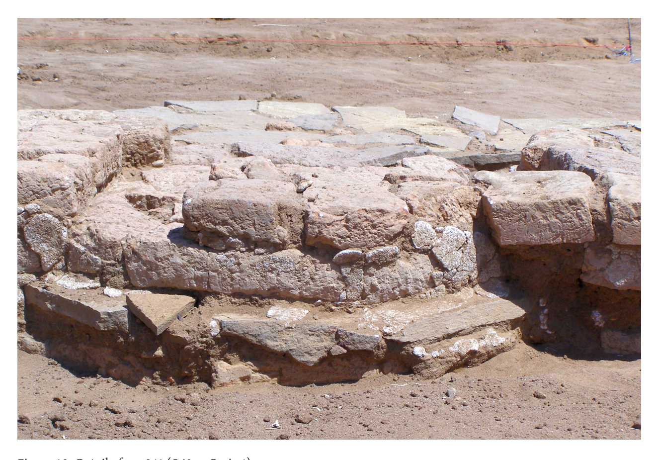
Figure 12. Detail of no. 341.