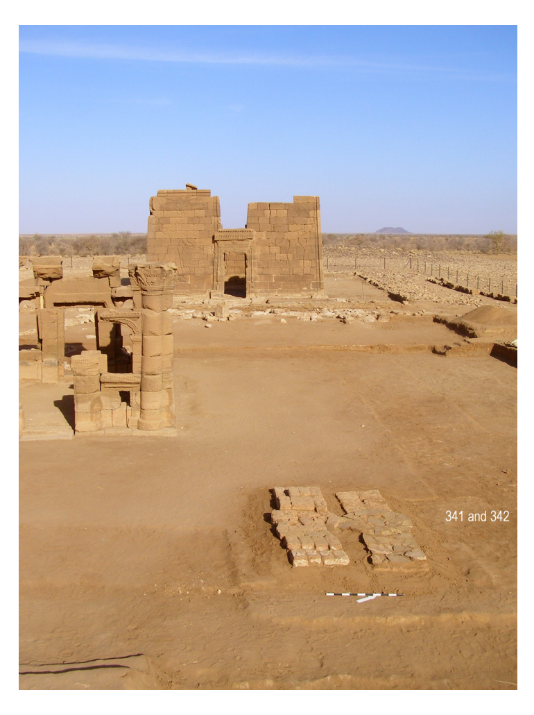
Figure 9. Location of the pedestals nos 341 and 342 on the axis of the Lion Temple 2009.