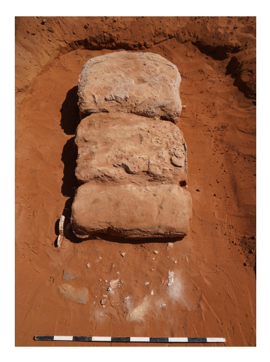
Figure 6. Throne Pedestal 700 consisting of three sandstone blocks.