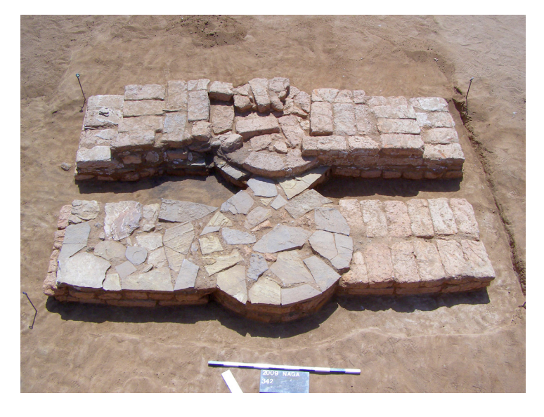
Figure 10. View of the two daises nos 341 and 342 with an approach from two sides toward a round central area.

very unusually, accessible from both sides over at least two steps, are oriented eastwest towards the Lion temple (west) and the temple of Amun (east).