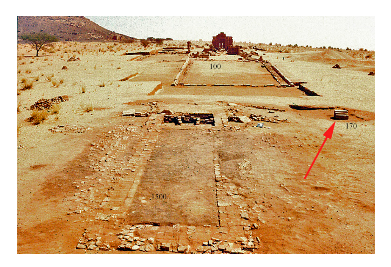
Figure 1. Location of the throne pedestal in the Amun temple district; in the foreground High Altar 1500.