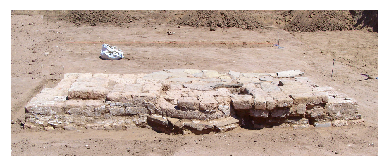
Figure 11. Nos 341 and 342 detail showing plaster and foundation.