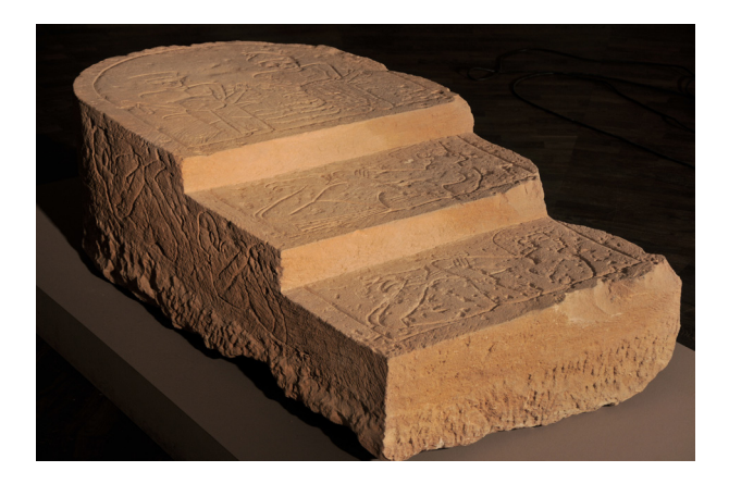
Figure 2. View of the decoration of the Throne Pedestal 170 with three decorated levels.