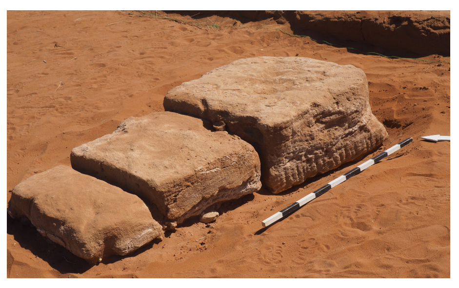
Figure 8. Throne Pedestal 700 with remains of the foundation visible.