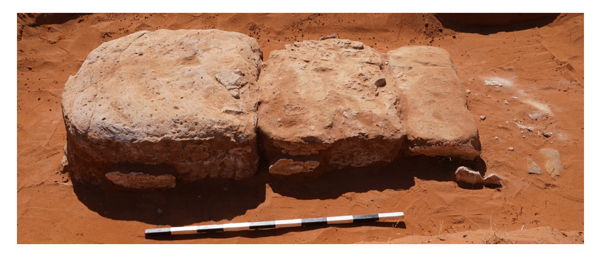
Figure 7. Throne Pedestal 700 with remains of plaster.