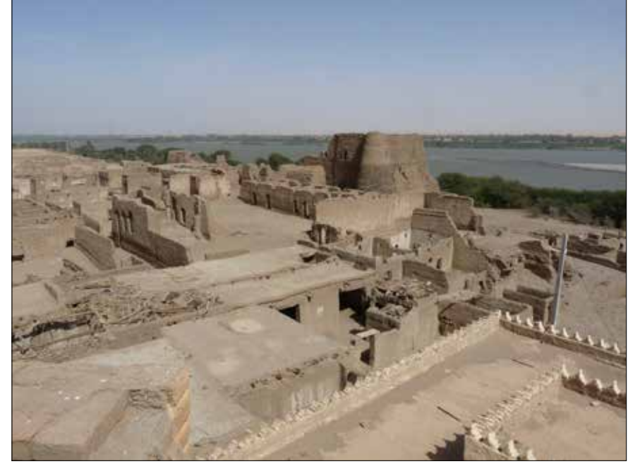
Plate 2. View of the abandoned town houses, with the fort in the background. Photo taken from the el-Hassanab minaret, looking north-east.

and in some early photographs (late 19th and early 20th century), and from these it is clear that the fort had a range of rooms along the south wall and in the middle of the west side, besides the 'keep' by the south-west tower. Remains of these walls can still be made out, but their relationships are difficult to distinguish on the ground, and await detailed planning. Much of the western side of the fort on the higher ground is filled with considerable deposits of dung, on which some of the latest walls were built, suggesting that the interior of the fort served to stable animals, most likely sheep and goat but also perhaps cattle, donkeys or horses, possibly while occupied also by humans before the latest (now in their turn ruinous) buildings were constructed there on top of the dung deposits. Before the beginning of the current project the local farmers quarried these deposits to use as fertilizer for their fields. This practice of building on top of layers of dung can also be noticed at a number of points in the town.