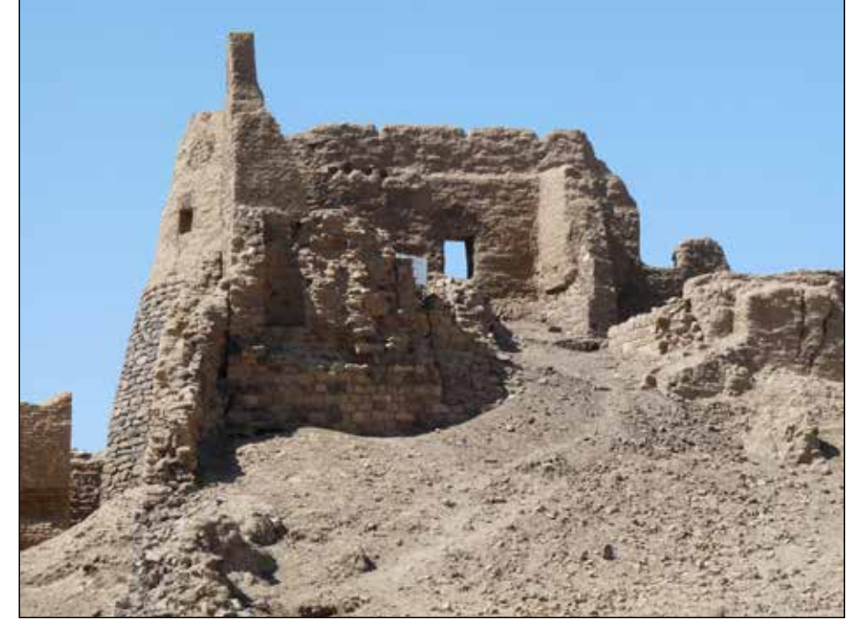
Plate 3. The keep in the south-west corner of the fort. Note the better cut stone blocks in the wall facing the viewer, and the deep niche, possibly a storage compartment seen in section.

sure of its provenance; the same caveat applies to the scarabs that were purchased in the bazaar in the early 20<sup>th</sup> century. The presence of finely cut 'ashlar' blocks in the fort walls was remarked on first by Waddington and Hanbury (1822, 219-20) in the south wall (now mostly destroyed), but others are still visible today in the citadel, particularly in the southwest corner (Plate 3). These must derive from a medieval, if not earlier, building of note. The fact that the windows in the wall (Plate 4) were not mentioned by any of the 19<sup>th</sup>