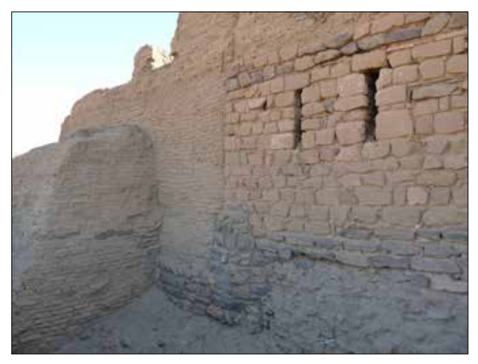
Plate 4. The west (external) wall of the keep.

century accounts may indicate that the area was hidden from view by private houses. Anecdotal references to a church or churches, both outside (Cuny and Gleichen) and inside the fort (Crawford), and the presence of red-brick fragments suggest their presence but remains unproven on the ground. The presence of the vaulted toskiya tombs found both to