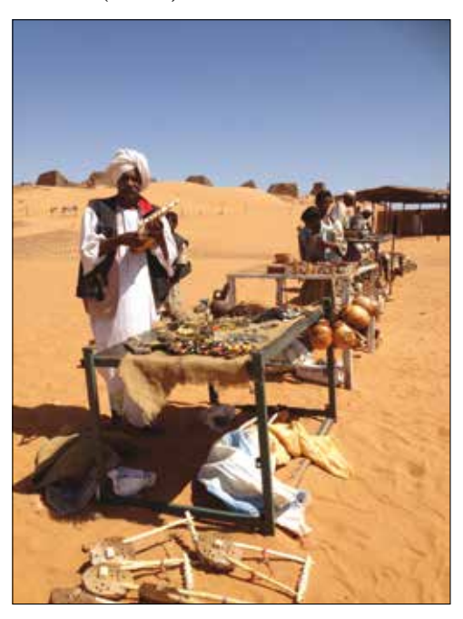
Plate 2. Traders at the pyramids, November 2015.

However, unlike in Peru, tourism in Sudan has stimulated no such economic impact. Even in 2011, the UNESCO Nomination File (Sudan's application for World Heritage status) describes not only the lack of infrastructure but also the challenges to the meaningful trickle down of existing tourism revenue (El-Masri 2010, 162, 182, 198, 204). Although archaeology is under-funded worldwide, the disjuncture between Sudan's ancient archaeology and the central government's vision of the modern Arab-Muslim state means that the budget allocated to NCAM is certainly not enough to support tourism development. Bejrawiya is one of the most visited archaeological areas in the country, yet residents pointedly described tourism as an 'overdue' prospect, still an aspiration rather than a reality. This was one of the few topics all residents agreed upon, including the traders who work at the sites (Plate 2), and corroborates the author's own