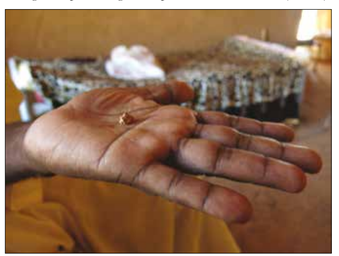
Plate 4. A Mansūrī man displays his idea of 'benefit': gold, November 2015.