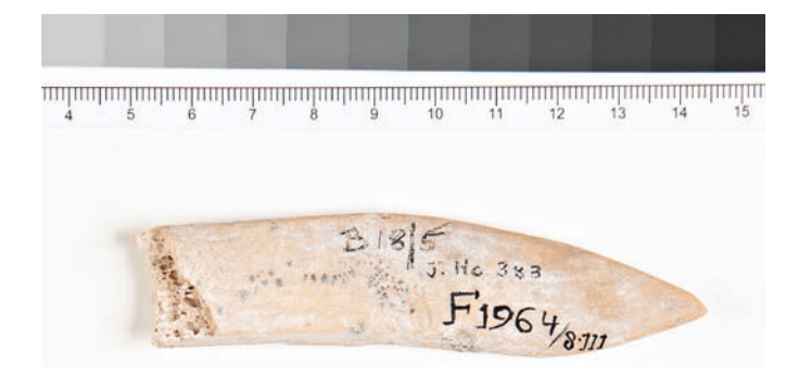
Figure 6. Pin-beater, RMO F1964/8.111.

In Shokan, the Dutch mission also found 651 loom weights, 139 parts of loom weights and 164 pieces belonging to an unknown number of loom weights. They brought only 19 of the complete loom weights back to Leiden. All of these were discovered in the first excavation season. The 19 loom weights, all made of brownish-grey unfired Nile clay, weigh between 87-957g, with an average weight of 491.5g. The average length is 124.5mm. The heaviest loom