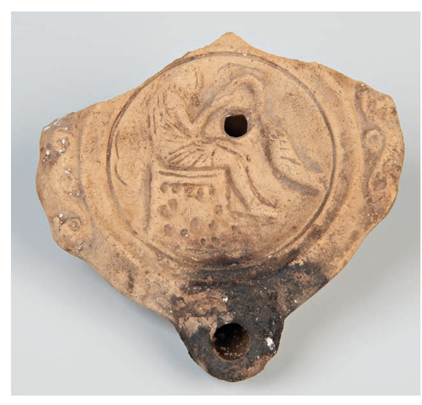
Figure 4. Oil lamp, RMO F1964/5.105.