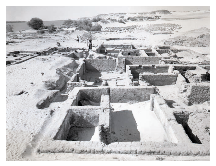
Figure 2. Overview of the excavation of Buildings B5 and B19. Abu Simbel is visible in the background cliffs (photo Rijksmuseum van Oudheden, Leiden).