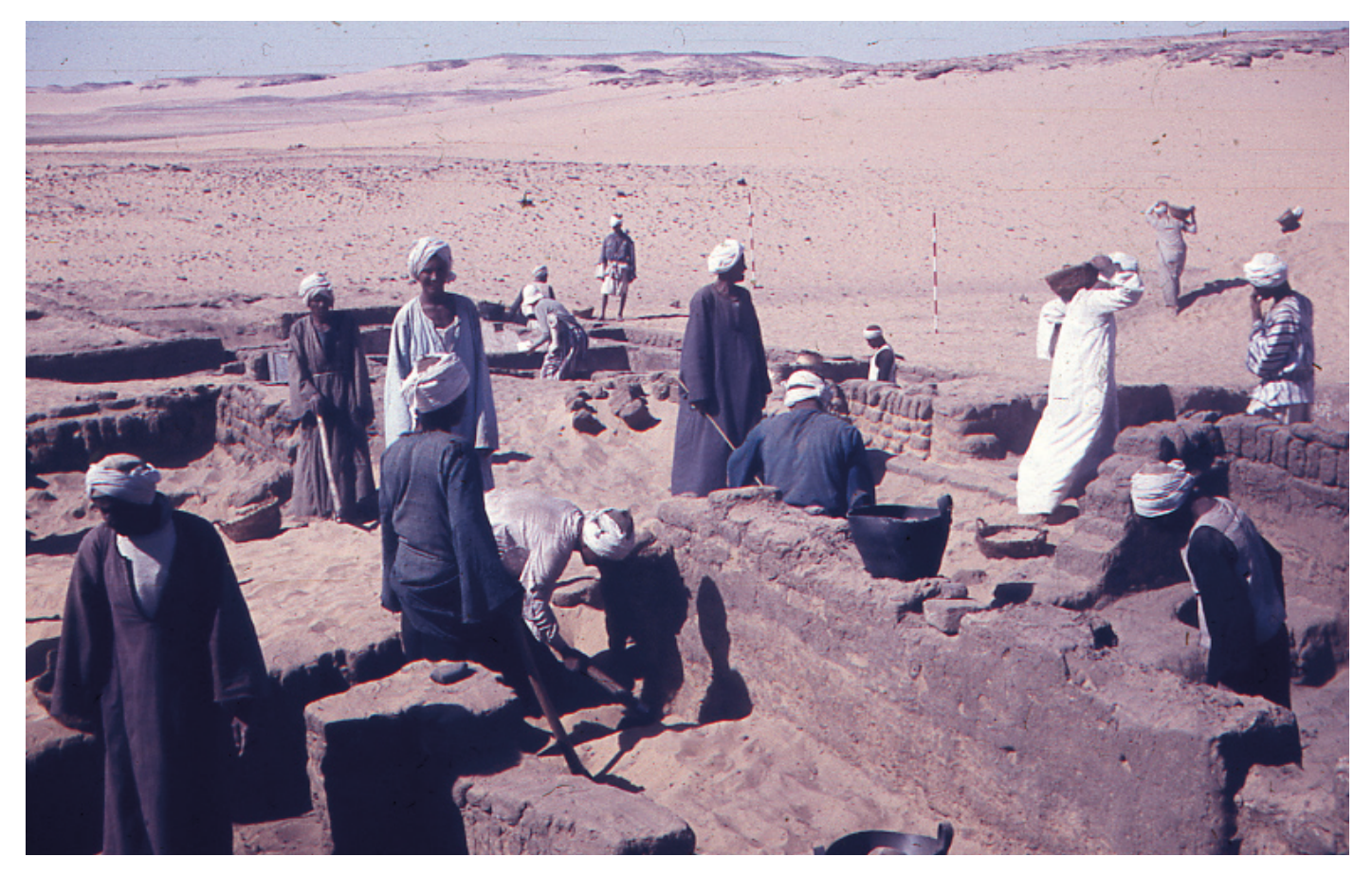
Figure 1. The Shokan excavation team at work in Building B1 (photo Rijksmuseum van Oudheden, Leiden).