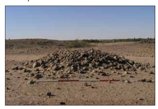
Plate 1. General view looking north west before excavation.

In an attempt to elucidate the purpose of the mound it was initially half sectioned to reveal its construction and the material from which it was made. Following that, the remaining half of the mound was removed and the surface underlying it was 'cleaned' in order to reveal any features present.