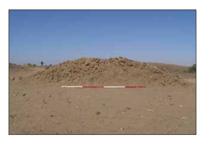
Plate 2. East facing section of the mound.