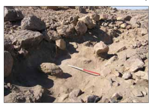
Plate 4. The substantial rock wall with structure F8 in the foreground and F7 behind, looking south west.

The large excavated area between the F1-3 and F6-9 structures did not contain any wholly convincing structural remains. After removal of the unstratified build-up