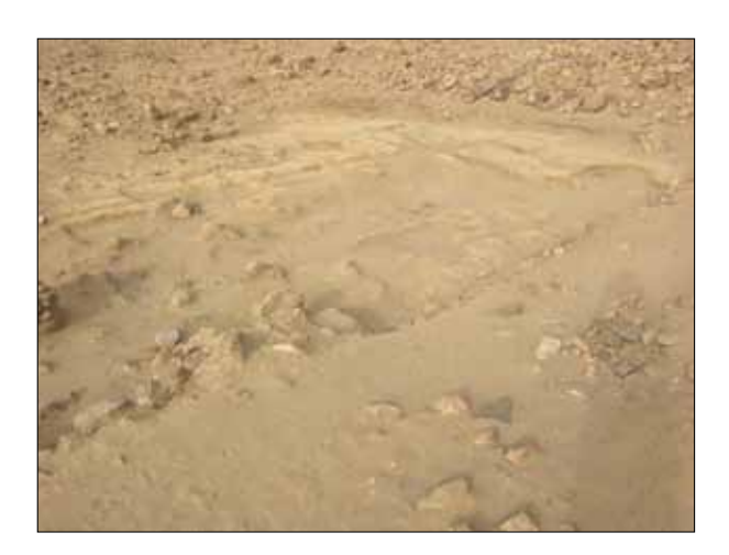
Plate 3. Eastern area of excavation, linear features cut into the silt/sand alluvial deposit. Looking north east.

The baking occurred across the surface of this area of alluvium bore no relation to the features also cut into it. No structural features or burnt deposits were associated with the baking and the baking was of an 'ephemeral' character. The baking may thus have been the result of a single fire event rather than being associated with any long term processes.