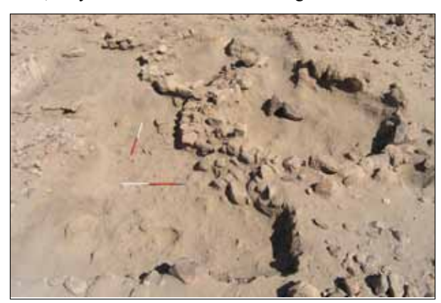
Plate 2. Structure F3 with structures F2 and F1 beyond, looking north east.

The fills within these three structures had no discernible differences to the overburden layers found throughout the site. They were composed of loose, wind-blown sand/silts and had no layers or surfaces present within them. As such, only the walls of the structures gave an indication