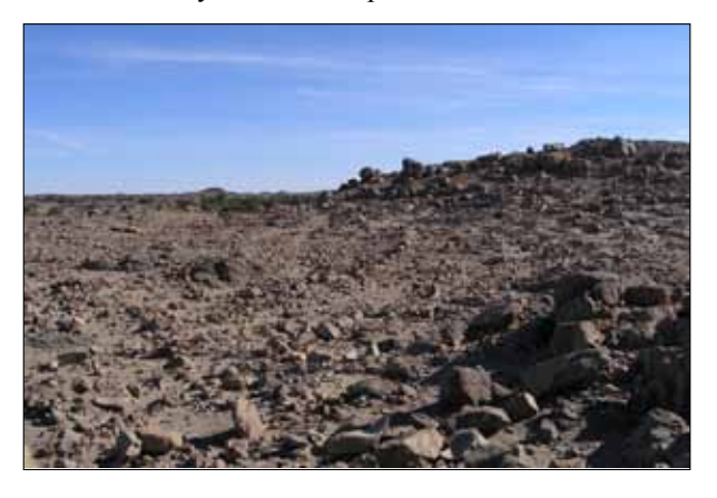
Plate 1. General view of site prior to excavation. Looking south towards the hill occupied by the cemetery, site 3-J-20.

The settlement occupied an area approximately 130 × 130m (Welsby 2003, 13-14). It has been heavily eroded, the surface consisted of angular rocks strewn across the whole settlement area. Most of the rocks were set within and on a loose silt/sand matrix, the overburden/collapse deposit. In several places the site had fewer rocks on its surface, where small shallow depressions signified the interiors of buildings or rooms. In a few cases the rocks were in situ , still being part of preserved structures underlying the overburden layer. The surface of the site was extensively littered with potsherds of medieval date.