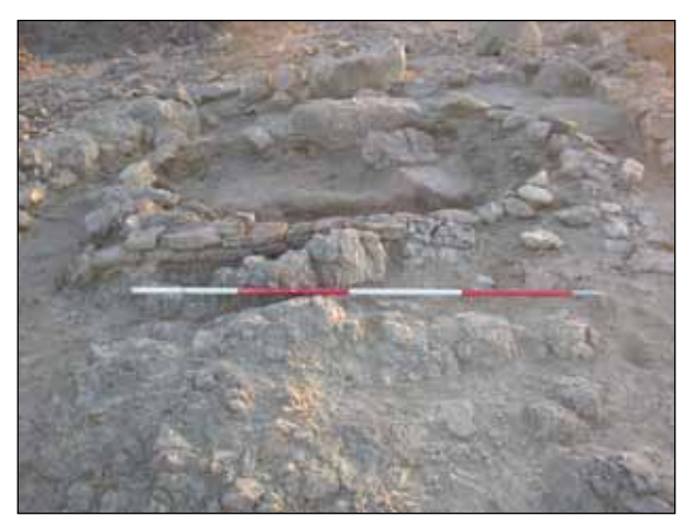
Plate 2. Remains of the red-brick grave monument, looking south south west.

The grave cut was flanked on its north north east side by a single line of red bricks 300 \times 150 \times 60 mm in size surviving to two courses in height (Plate 2). The line of bricks was presumably all that remained of the grave monument and its exact form can only be speculated upon. What is clear is that the remains comprising its northern side were at a distance of 1m from the centre of the grave cut. Assuming the grave cut was central to the monument, the monument would have had a width of 2m or more. No other example of a red-brick monument of this size was present on Mis Island.