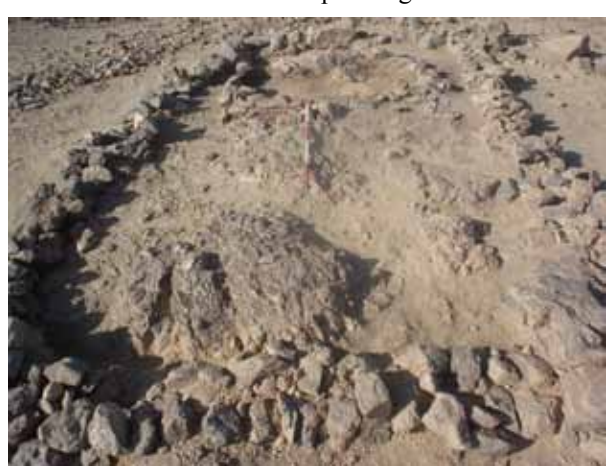
Plate 1. General view, looking south south west.

Within the south south west side of the structure, a little off-centre, was the grave cut. This was aligned east south east – west south west, had straight sides and rounded ends. It was cut into the compacted gravel and bedrock