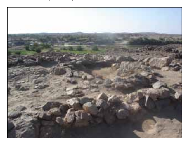
Plate 3. General view across site, illustrating the view of the surrounding area to the south south east.

whose final resting place it marked. Being on a high point, the monuments on the site and especially the stone structure would have been visible from a large proportion of the island (Plate 3).