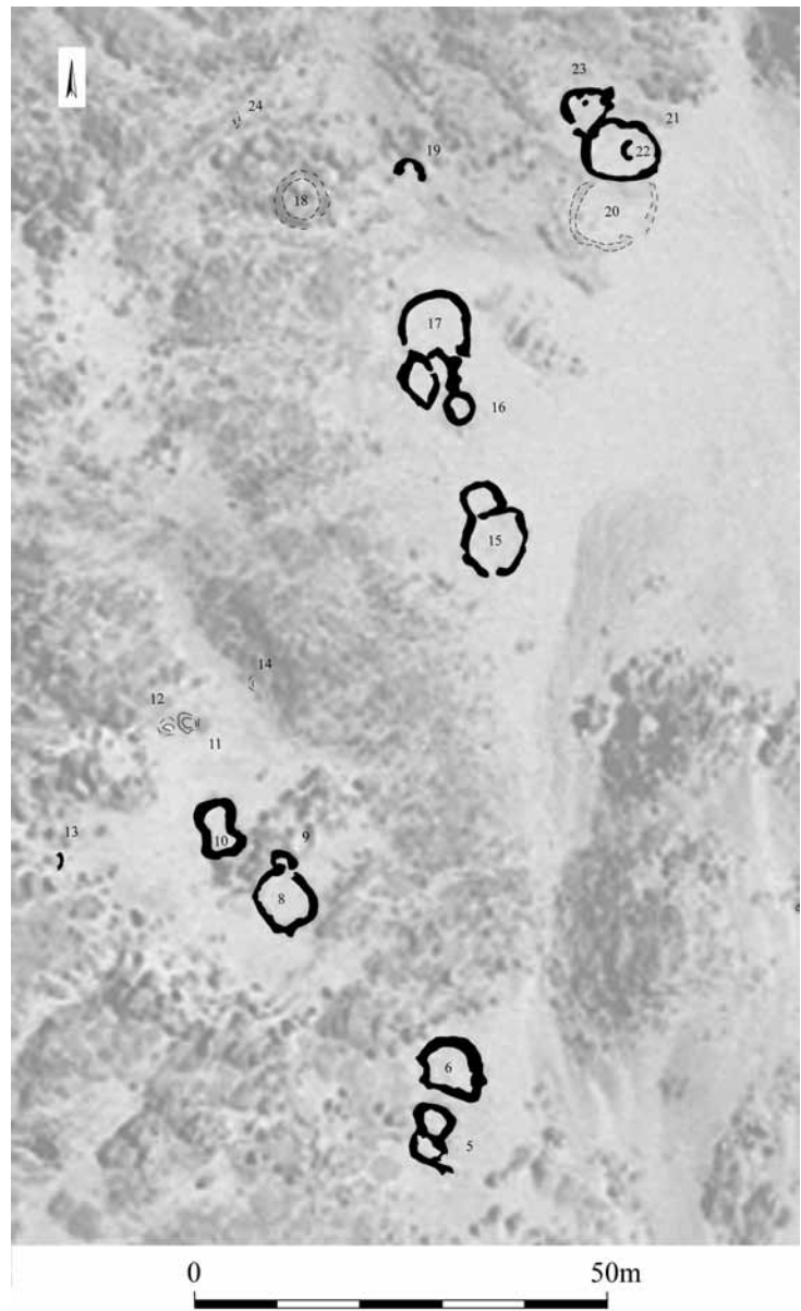
Figure G.2. Site 4-G-15 (scale 1:1000).