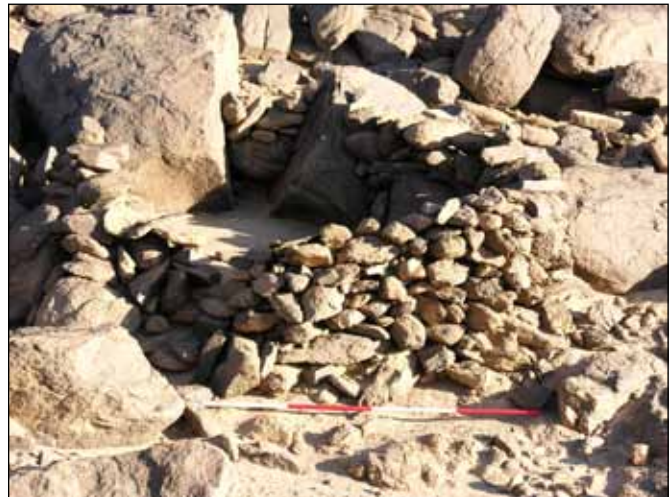
Plate G.5. Site 4-G-15; feature (11).