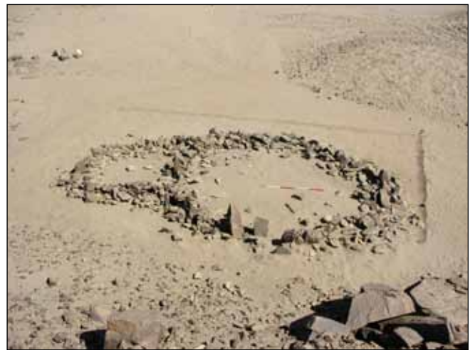
Plate G.7. Site 4-G-15; general view of the hut (15).