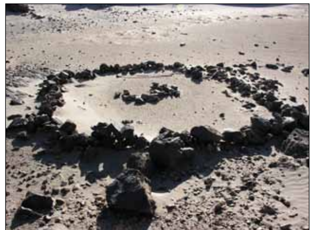
Plate G.9. Site 4-G-15; hut (21) with internal feature (22).