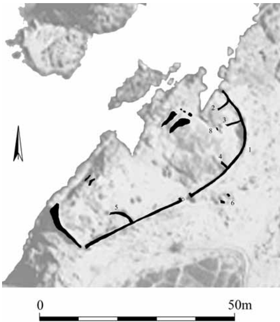
Figure G.1. Site 4-G-1 (scale 1:1000).