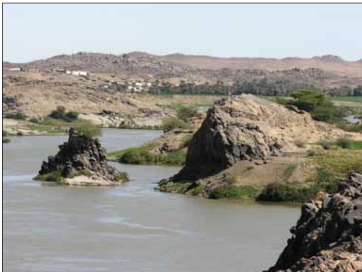
Plate G.1. Site 4-G-1; looking upstream.