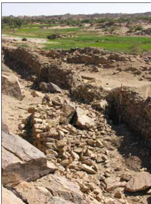
Plate G.3. Site 4-G-1; structures against the inner face of the defensive wall.