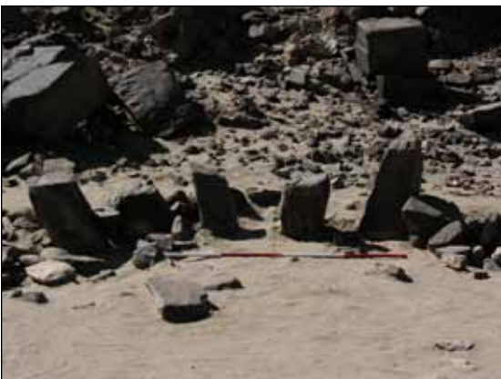
Plate G.8. Site 4-G-15; detail of the orthostats in the wall of hut (15).