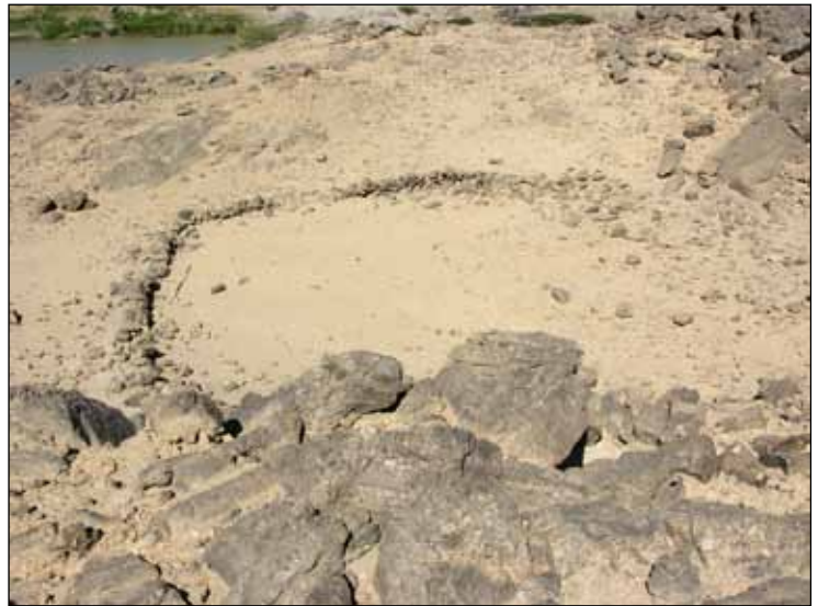
Plate G.10. Site 4-G-30; general view of the enclosure (3).