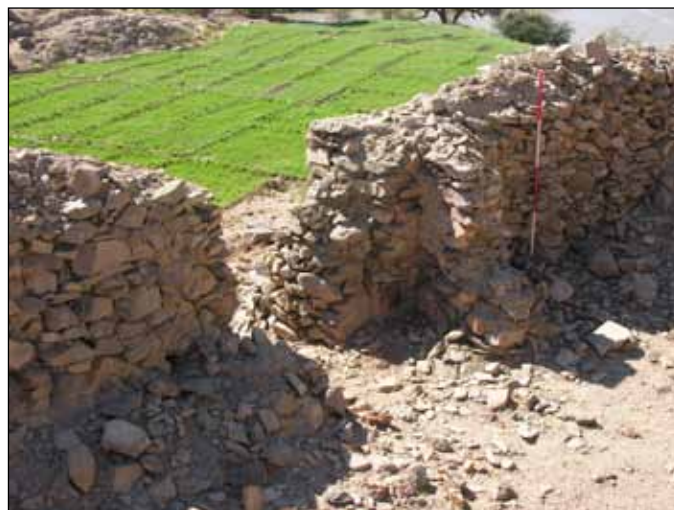
Plate G.2. Site 4-G-1; the main gate, interior.