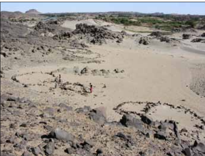
Plate G.6. Site 4-G-15; general view of the features (15-22) in the wadi bottom..