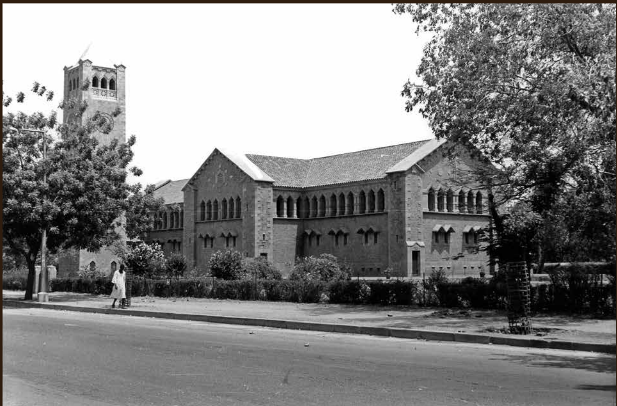
Khartoum. The Anglican cathedral in 1968. Now minus its bell tower it houses the Republican Palace Museum.