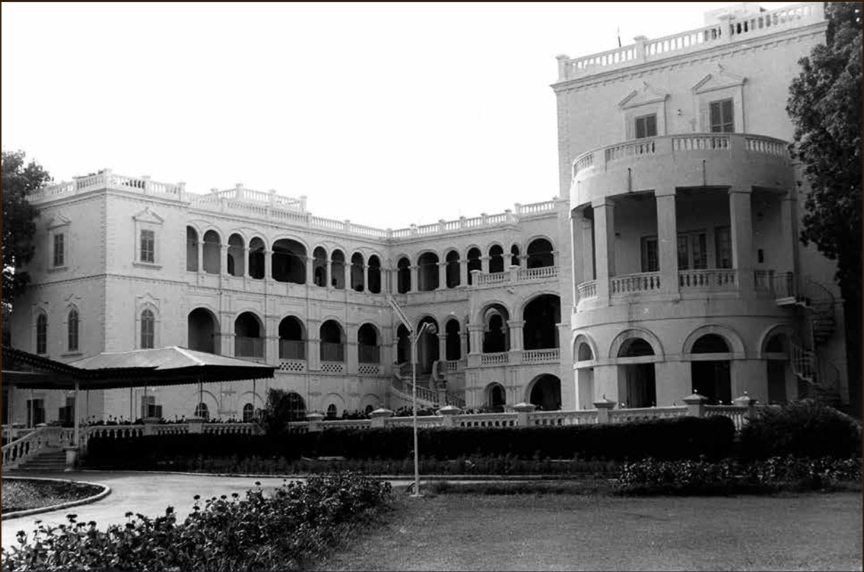
Khartoum. The Republican Palace, once the Governor General's residence, in 1968.