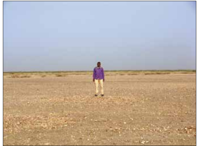
Plate 1. General view of Goaz es-Shor site.

Located some distance to the north east of Gwada village, and to the south east of the Sheikh Kamal ed-Din village, in the plain. Herbs and spiny shrubs abound on the surface of the site. The main feature is the qubba of Sheikh Mohammed As-Selaihabi, who passed away in 1275 AH. He was a disciple of Sheikh Ahmed et-Tayib, son of el-Bashir the first sheikh