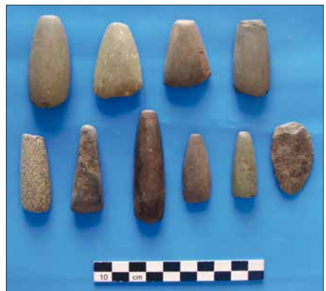
Plate 4. Axes and adzes – Goz Habbabna.

Located to the east of the village of el-Mahraiba Bilal, to the west of the village of Wad Eghaibish, it extends over a large area of up to 5km 2 , in an area of goz . This region does not fall within the Gezira Agricultural Scheme lands. Large quantities of archaeological remains dating to the Neolithic are visible on the surface, especially many different sized axes and adzes (Plate 4), grinders and pottery. A wide range of stone types were used to make the axes including flint, basalt and granite. Also on the surface were many types of ivory lip-plugs (Plate 5) and a few beads. This site is the largest of those studied during this season. It is closely similar to the sites along the Nile, especially those in the Khartoum district (Caneva 1988; Choldnicki et al. 2011). It is suffering from destruction in some parts due to indiscriminate digging, but other sections remain untouched.