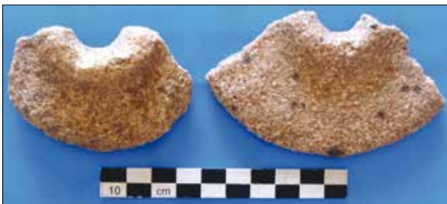
Plate 6. Maceheads from the surface of Goz Abu Gunbak 2.

Located immediately west of the village of Abu Gunbak, and on the western border of the Gezira Agricultural Scheme. It sits on a few goz , within the flat area. There is an abundance of the archaeological finds on the surface of the Mesolithic and Neolithic, with a variety of types of decoration on the pottery. There is also an abundance of grindstones of various forms and maceheads (Plate 6), and there were some ivory lip-plugs. The human skeletons that appear on the surface are mostly contracted, and similar to those found at many sites in central Sudan, such as Jebel Sabaloka (Suková and Varadzin 2012, 125). However, one of them was lying stretched on its back, aligned north-south. There is widespread grazing over the site, which is threatening to cause damage to archaeological material.