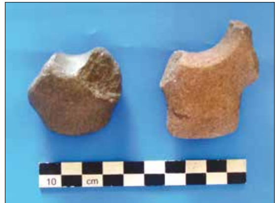
Plate 3. Axes with a hole for insertion of a handle – El-Uqda.

on the surface. The presence of the modern cemetery has protected the site from encroachment and digging, but it has to be studied as the modern cemetery is expanding and encroaching on the site. The site can be compared with Early Khartoum in terms of Wavy Line pottery (Arkell 1949, pl. 61).