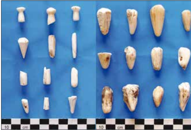
Plate 5. Types of ivory lip, nose and ear-plugs – Goz Habbabna.

Located on the south-eastern side of the village of Goz Abu Gunbak, surrounded by agricultural land, in a flat area interspersed with many Acacia nilotica (Sunt) and Balanites aegyptica (Heglig). There were a few artefacts dating to the Mesolithic: Wavy Line and Dotted Wavy Line pottery and fragments of grinding tools along with an occasional microlith. The site is being damaged due to heavy traffic movement around it.