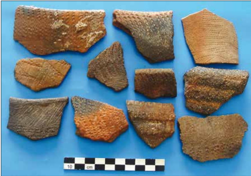
Plate 7. Pottery with Dotted Zigzag motifs – Goz Sheikh Modawwi 1.

in a goz area stretching for up to about 2km. Trees and grass cover large parts of it, as it descends toward the south and east. This site contains many forms of grindstones, as well as Mesolithic and Neolithic pottery. The presence of Dotted Zigzag pottery suggests that the occupation here represents a transition between the Mesolithic and Neolithic (Plate 7).