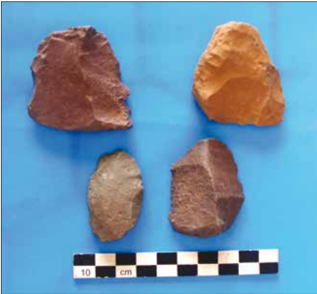
Plate 2. Stone tools from the surface of Goz er-Rehaid 2.

by the expansion of housing. The largest threat comes from heavy machinery digging and moving earth.